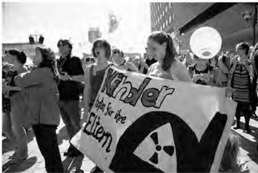
Jugendbewegung gegen Atomkraft