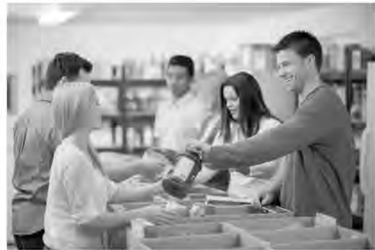
Hilfe für Asylanten