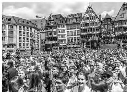
Abendveranstaltung in Frankfurt zum 25. Jahrestag der Wiedervereinigung