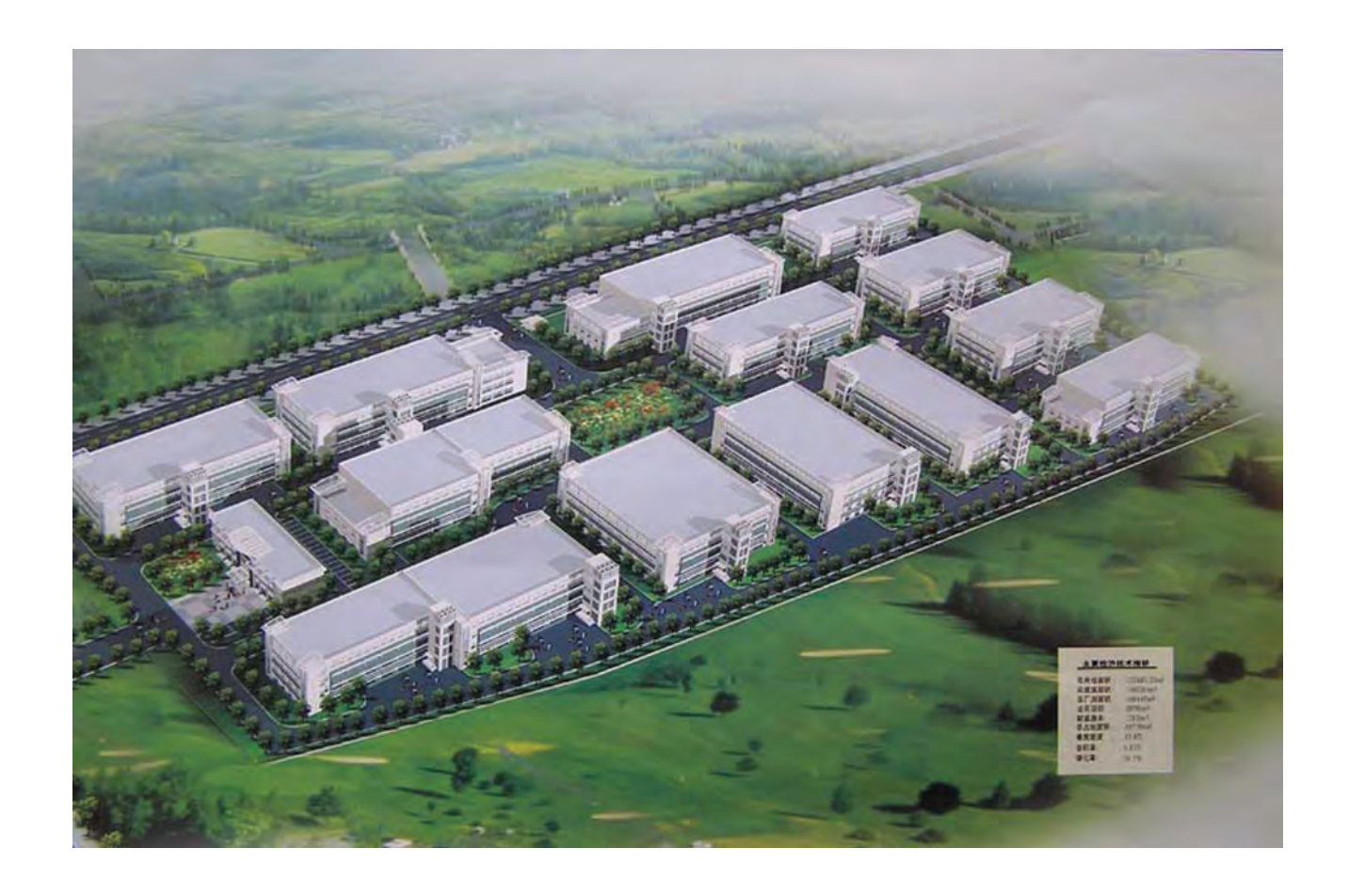
Fig. 1 for Question 2 Artist's impression of an industrial park to be built in China