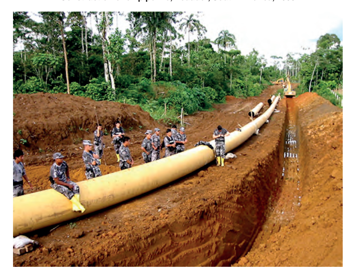
Photograph A for Question 4 Construction of oil pipeline, Ecuador, South America, 2003