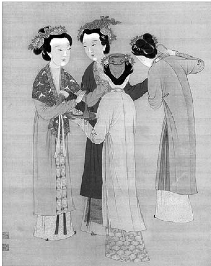
'Four Beauties', a Ming Dynasty painting

Extract adapted from an article on an English-language website sponsored by the Chinese Ministry of Culture