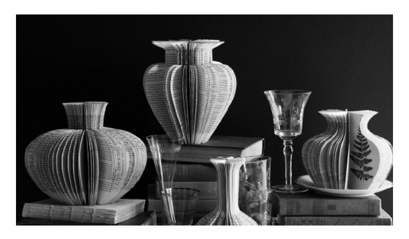
Lisa Occhipinti's Narrative Vases are often made with illustrated books.

Examples are stacking up. Vintage hardcover books are used for lamp bases and shades, a clever play on the culture of reading lamps. Anthropologie stores feature lights incorporating old book spines, while haute U.K. upcycler Lula Dot offers a stunning chandelier using vintage books splayed into sconces.