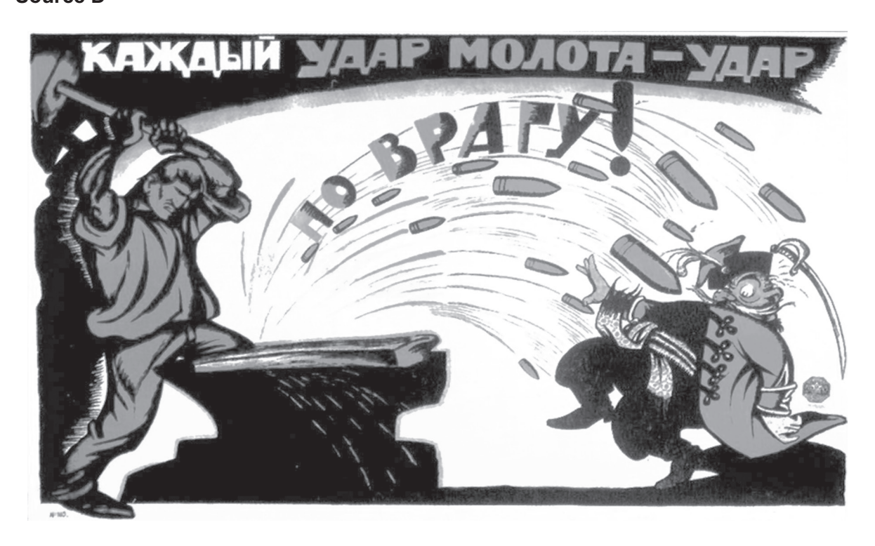
A Bolshevik poster published in 1920. The caption reads 'Every Blow of the Hammer is a Blow Against the Enemy!'

Answer both parts of the question with reference to the sources.