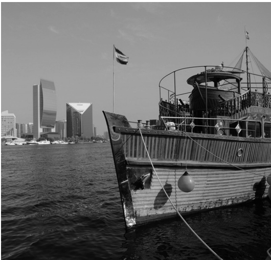
A traditional dhow

The ATB offers a range of travel services including travel insurance, conference bookings, incentive tours and car rentals, as well as the usual air travel and hotel reservations offered by most travel agents. The airport branch of the ATB operates a 24-hour call centre service as well as a 'Meet and Greet' service for passengers arriving at Abu Dhabi airport.