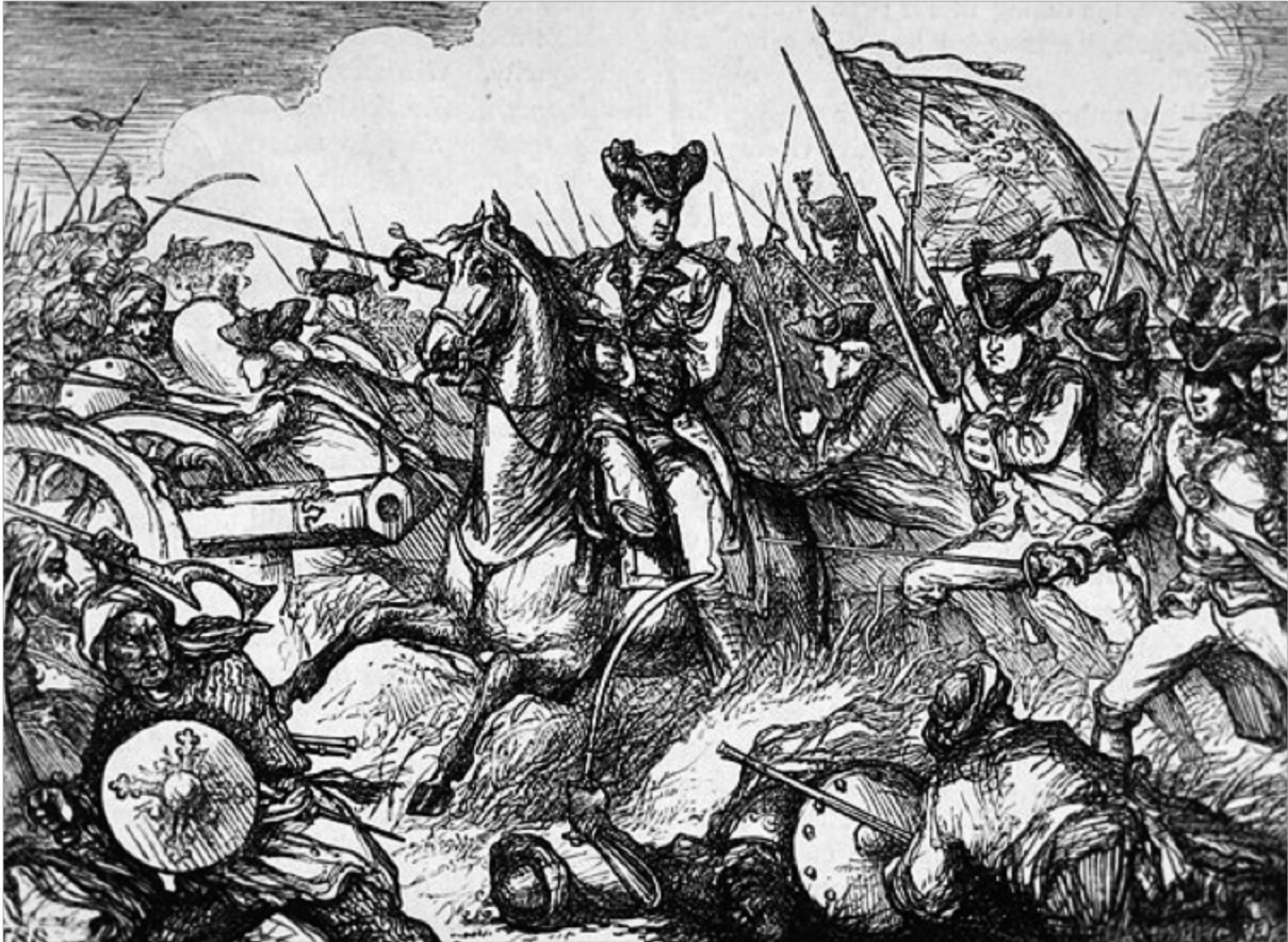
An eighteenth-century British print of the Battle of Palashi (Plassey)

During the war with France, which broke out in 1756, the British used internal divisions in Bengal to their advantage. They weakened the position of Sirajuddaula and when the disputes between the Nawab and the British led to conflict, it was the East India Company that was victorious. The decisive battle took place at Palashi in 1757. The British installed a puppet ruler in Bengal. British influence was extended by the acquisition of three districts in 1760 and by gaining the right to collect revenue. A treaty of 1765 allowed Bengal to be ruled by collaborators with the British in return for surplus revenues, but the rule of the Company did little for the people of Bengal. There was considerable hardship in the Great Famine of 1769–1770 and as a result of reforms to Company rule, such as the Permanent Settlement of 1793.