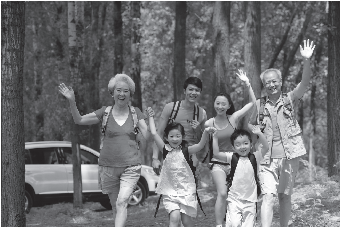
Photograph: Family on a trip out in the country