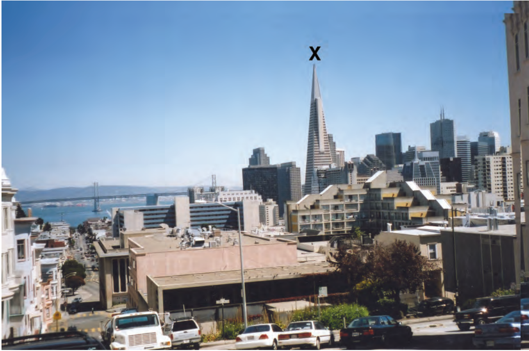
Photograph C for Question 3