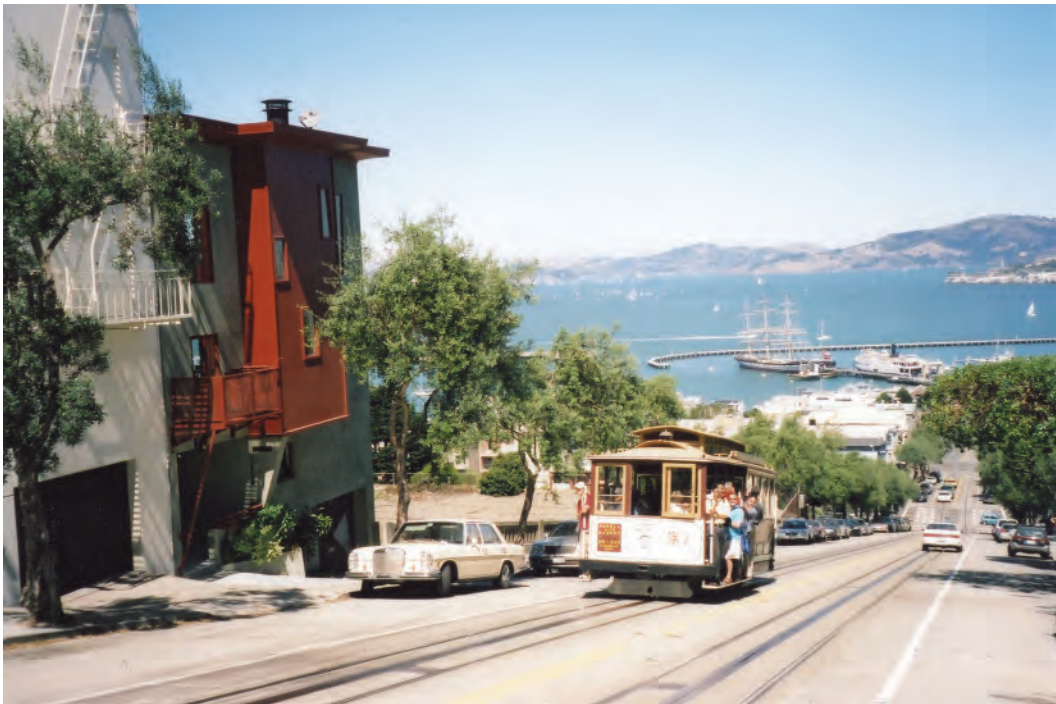
Photograph C for Question 3 is on page 4