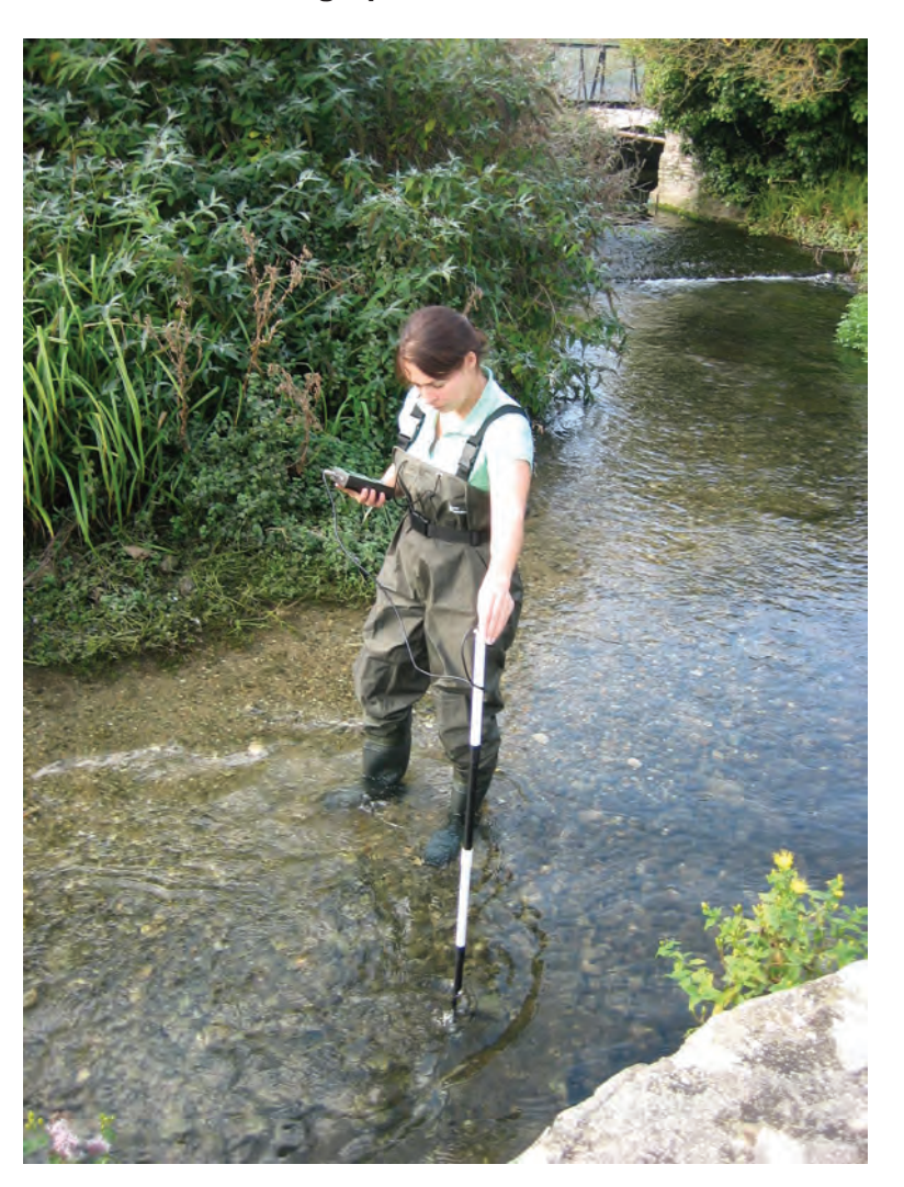
Photograph A for Question 2