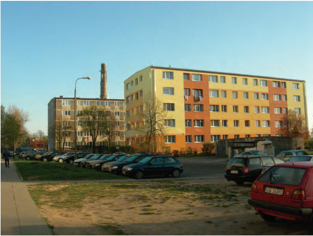
Photograph B showing area B for Question 2