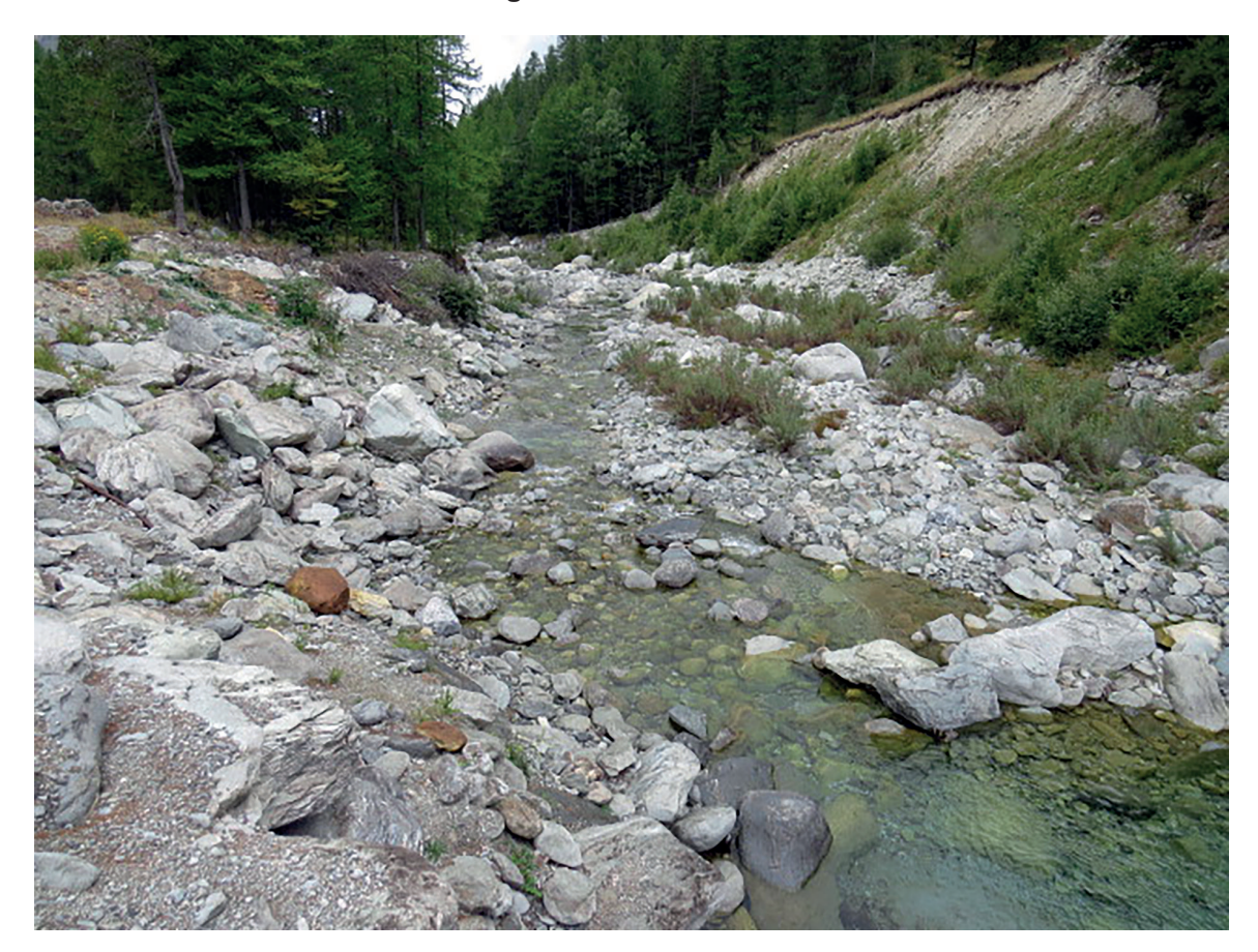
Fig. 3.1 for Question 3