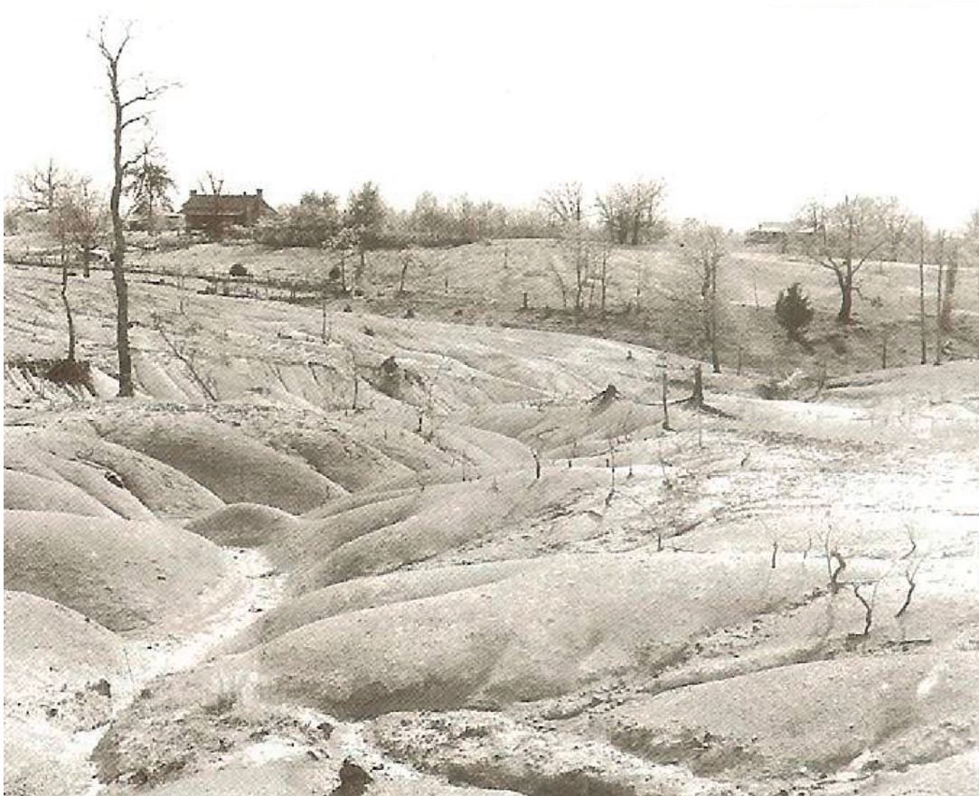
A photograph showing the effects of erosion in the Tennessee Valley.

14 Look at the photograph, and then answer the questions which follow.