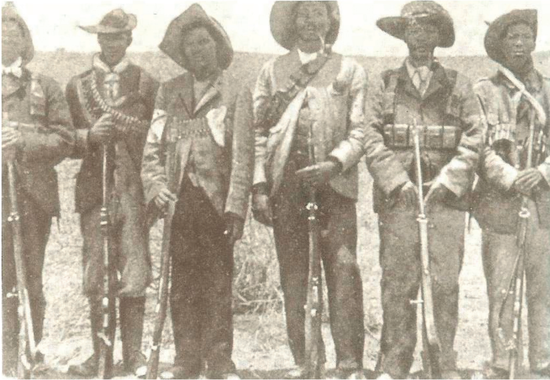
A photograph of Marenga and his guerrilla fighters in 1904.

19 Look at the photograph, and then answer the questions which follow.