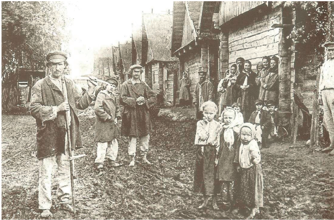
A photograph of a Russian village street around the beginning of the twentieth century.