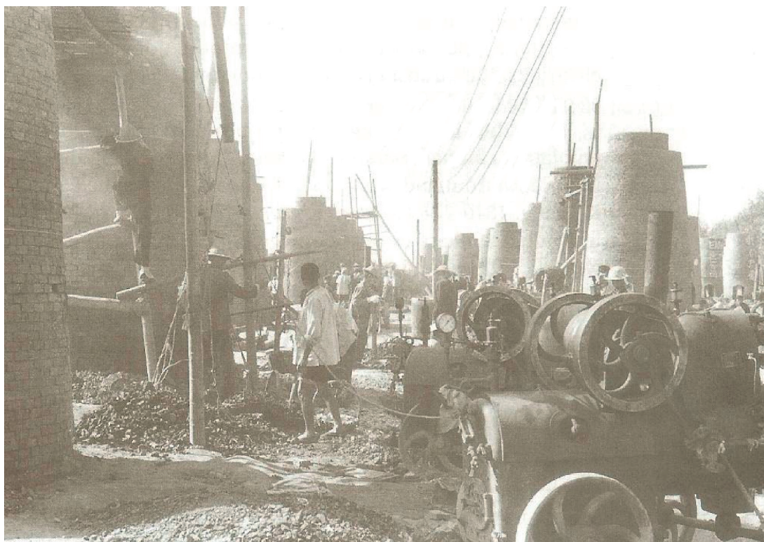
A photograph of 'Backyard Furnaces' in use during the Great Leap Forward.

15 Look at the photograph, and then answer the questions which follow.