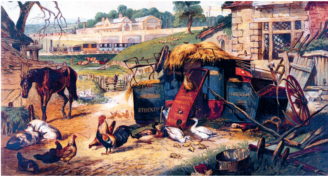
A painting of a country scene produced around 1845.

22 Look at the painting, and then answer the questions which follow.