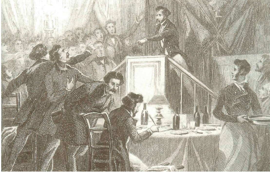
An illustration of a reform banquet held in Paris in 1847.