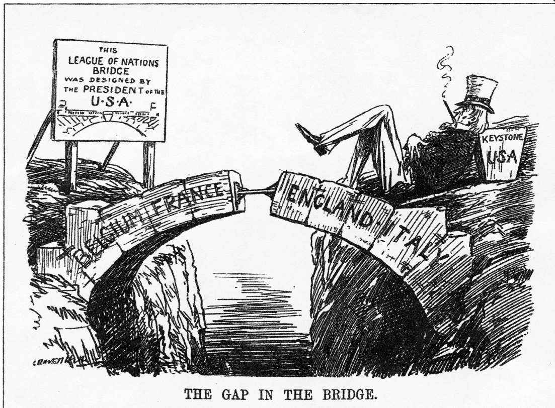
A cartoon published in a British magazine on December 10, 1919.