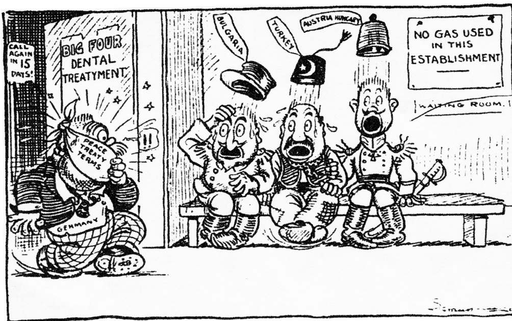
THEIR TURN NEXT.

A cartoon published in Britain in May 1919.