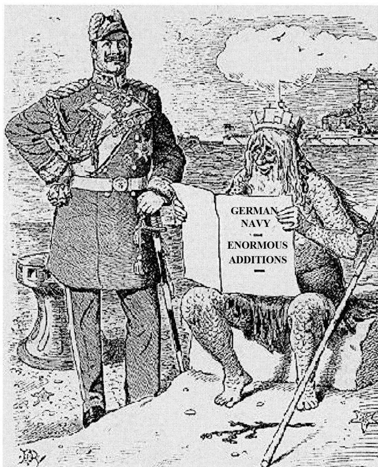
A British cartoon published in 1900. Neptune, god of the sea, is saying 'Have I got to learn German at my time of life?'