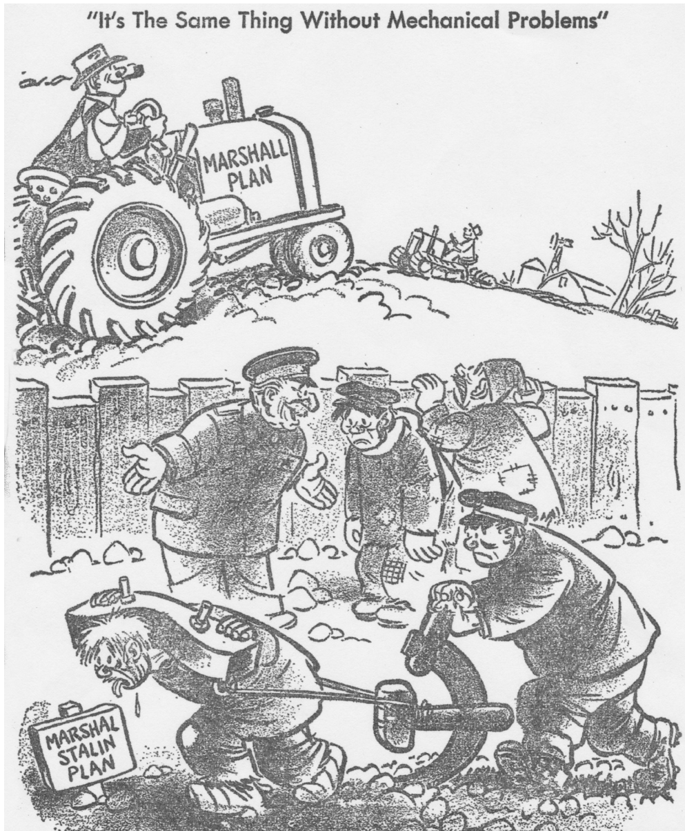
A cartoon published in the USA, January 1949.