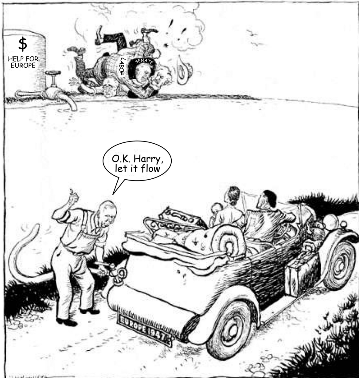
A cartoon published in Britain, June 1947. Marshall is speaking to Truman, who is held down by his opponents.