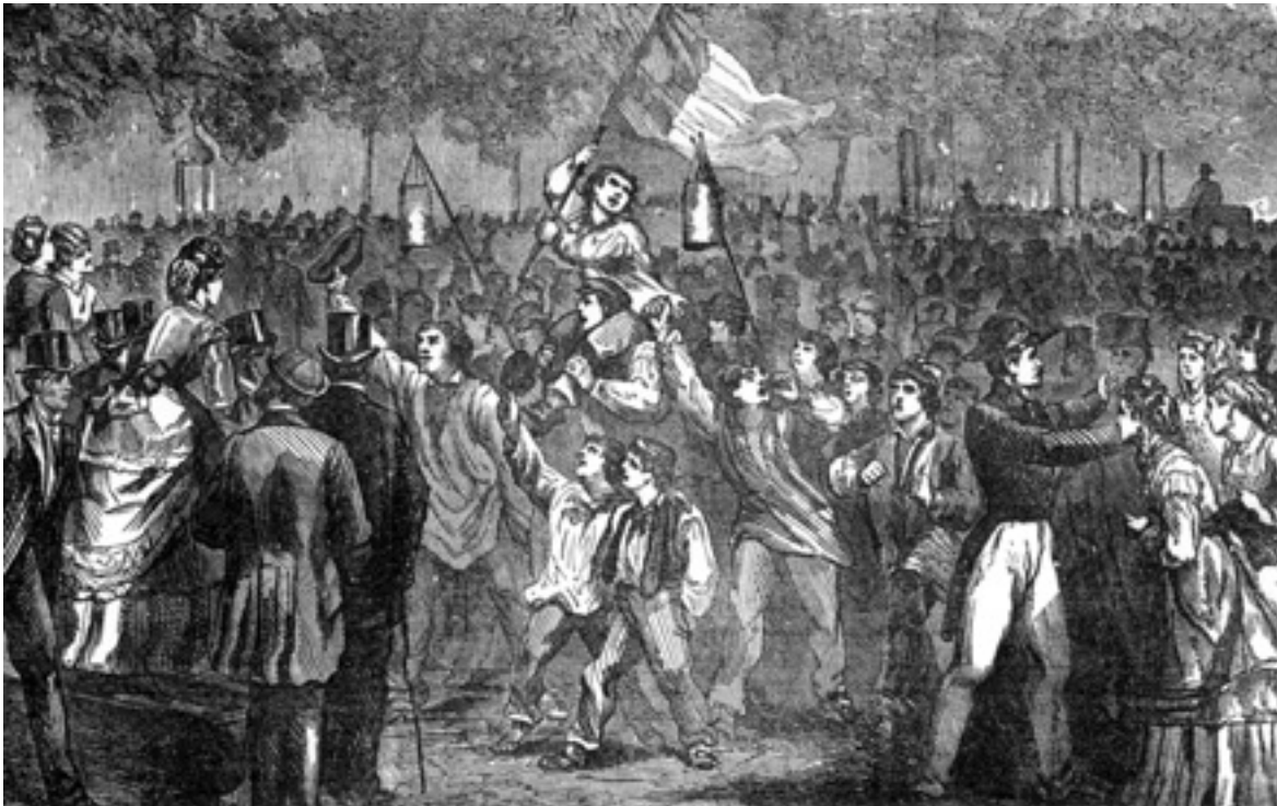
A drawing, from the time, showing French crowds celebrating the declaration of war against Prussia on 19 July 1870.