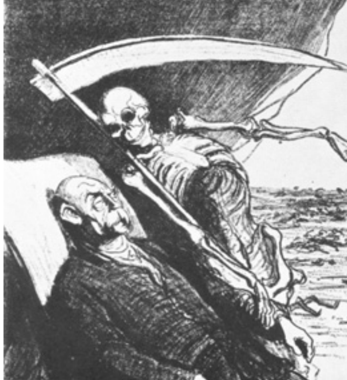
A cartoon showing Death thanking Bismarck for the thousands killed in the course of unification.