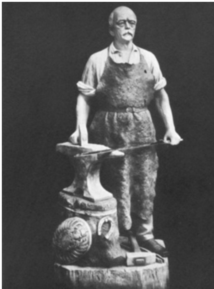
A statue of Bismarck as Germany's creator. It shows him making weapons which would be used to unify Germany.