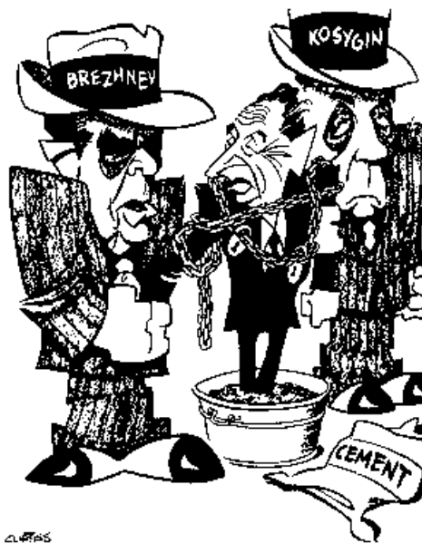
An American cartoon about the Soviet invasion of Czechoslovakia in 1968. It shows Brezhnev and his deputy as gangsters. The man in the middle is Dubček. His feet are being dipped in concrete.