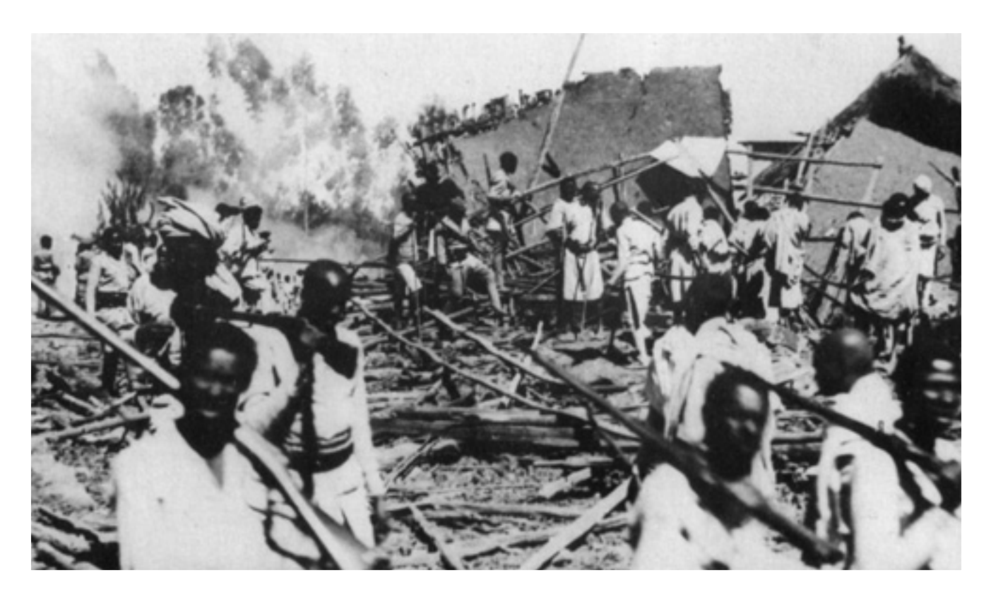
An Abyssinian village bombed by Italian aircraft in the invasion of 1936.