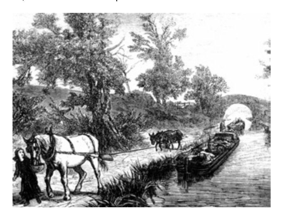
An early nineteenth-century drawing of canal barges.

22 Study the picture, and then answer the questions which follow.