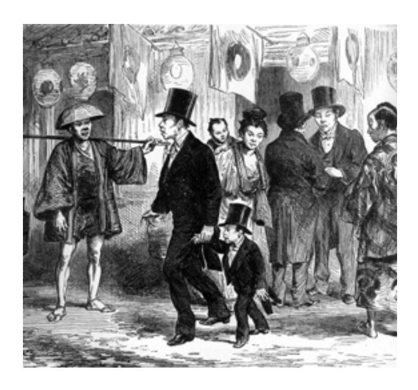
A cartoon published in a British magazine in the second half of the nineteenth century. It shows some Japanese wearing western fashions.