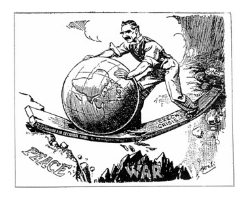
A cartoon published in a British newspaper on 25 September 1938.