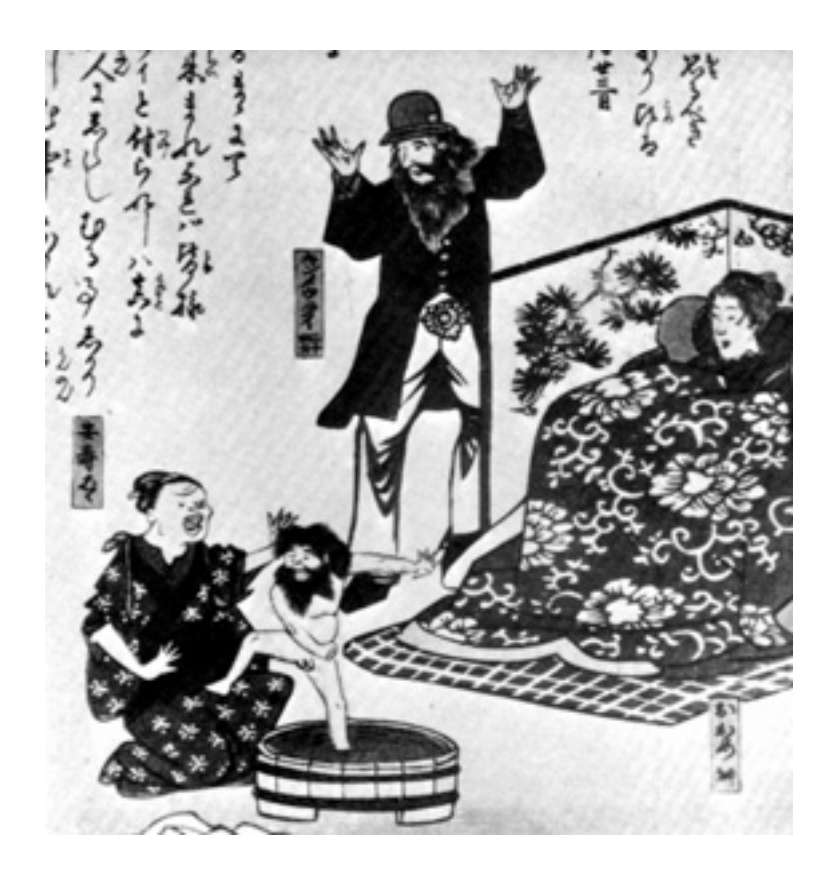
A Japanese drawing from the second half of the nineteenth century showing what would happen if Japanese women married Western men. The child is the result of the marriage.