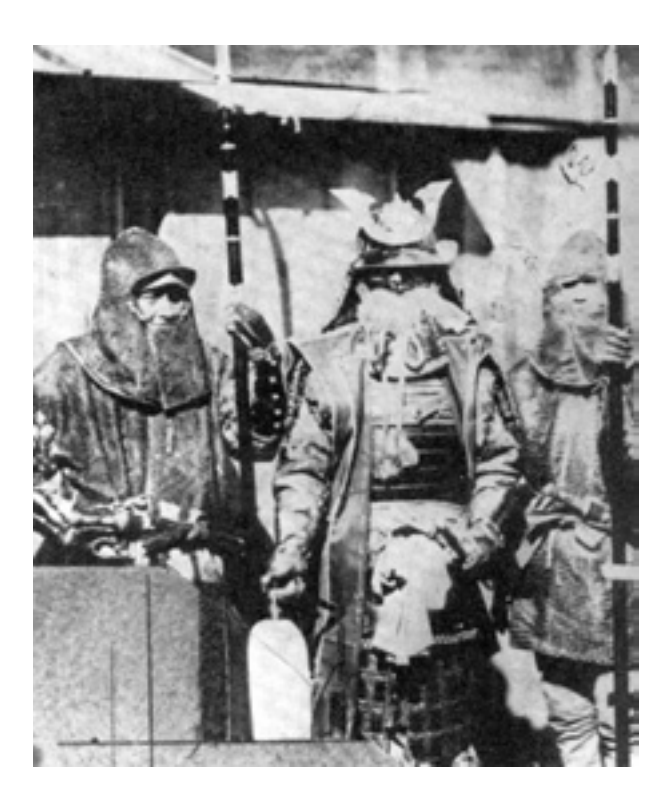
A photograph of Japanese warriors in 1868.