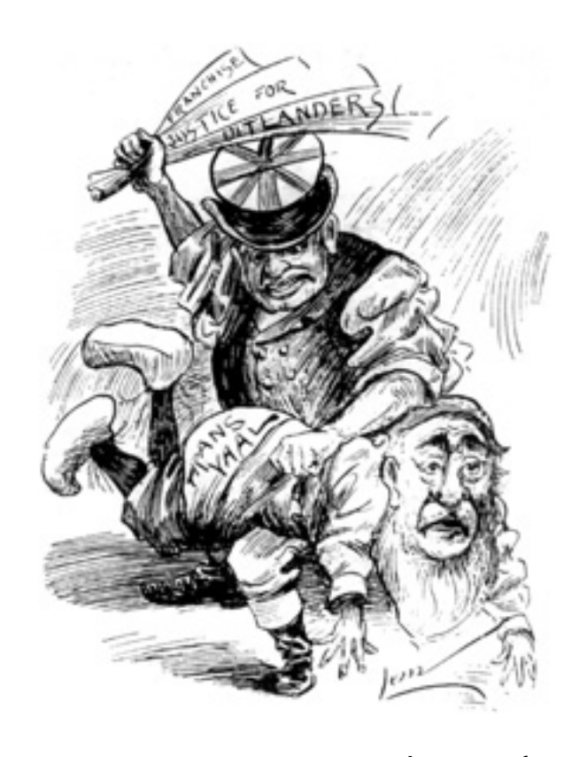
A cartoon from a British newspaper, 1899.