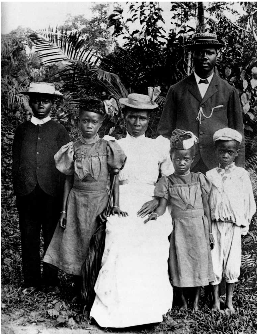
Photograph taken in 1898 of an African family who lived with Christian missionaries who wanted to show that Africans could be westernised.