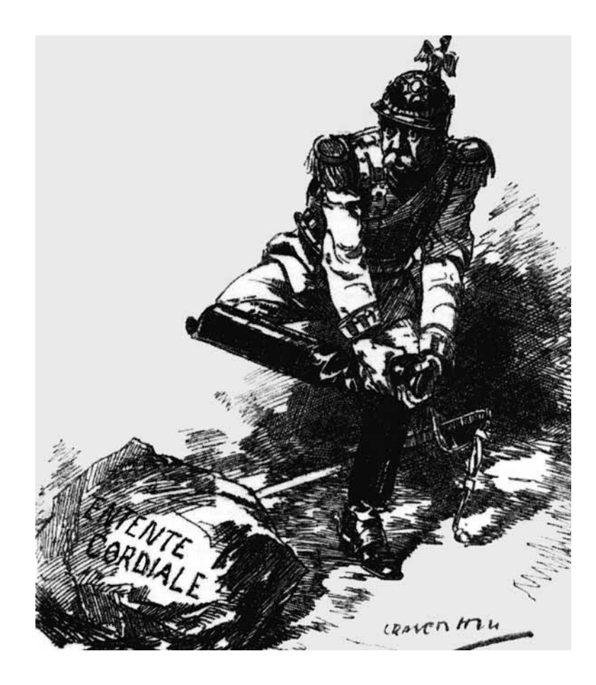
A British cartoon published in August 1911. The figure representing Germany is saying 'It's rock. I thought it was going to be paper.'