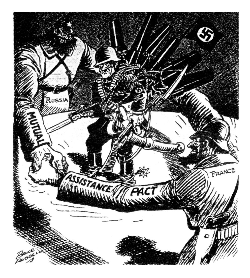
An American cartoon published in March 1936.