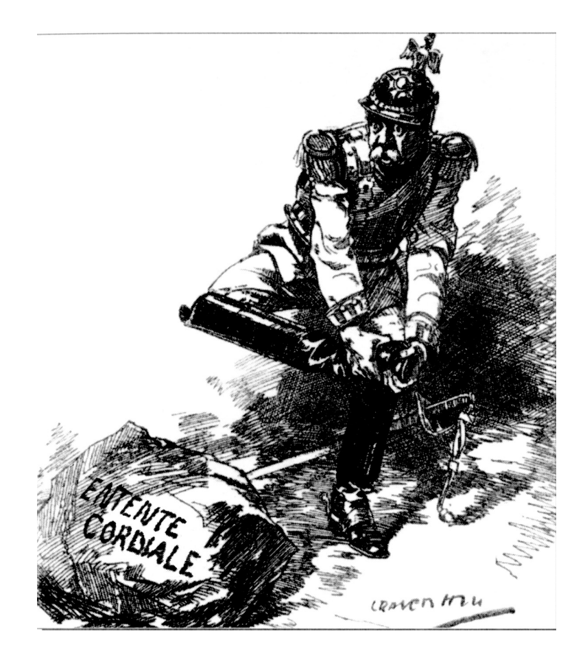
A cartoon about the Second Moroccan Crisis published in August 1911. The figure representing Germany is saying 'Oh No! It's rock. I thought it was going to be paper.'