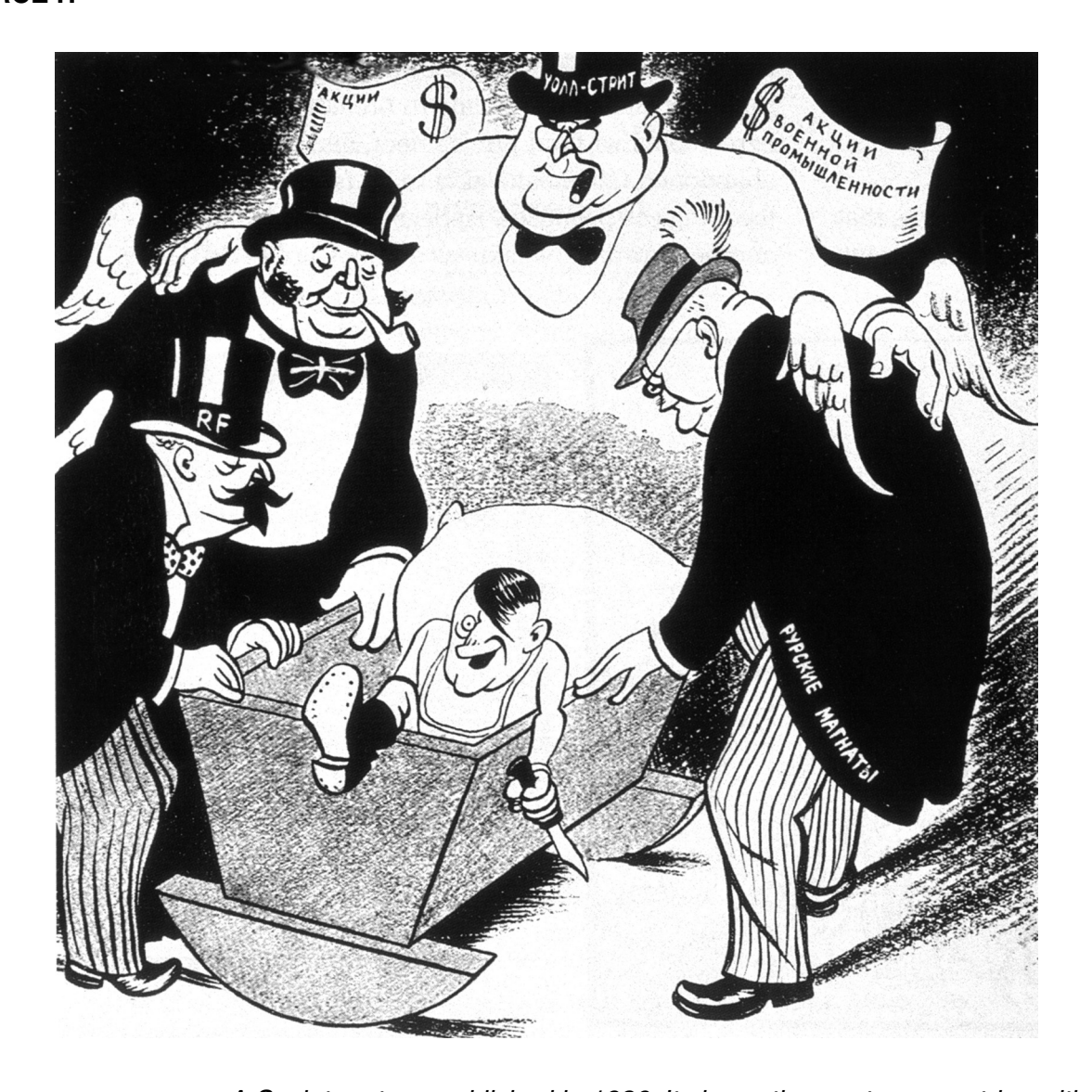
A Soviet cartoon published in 1936. It shows the western countries with Hitler.