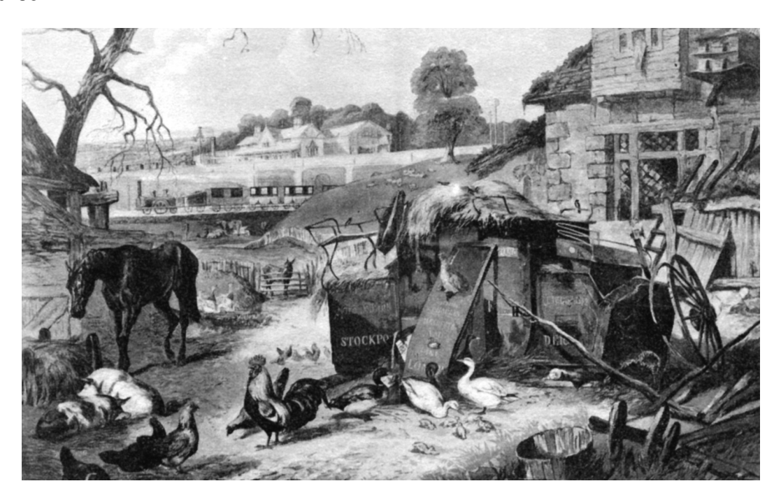
A painting of 1850 called 'Past and Present Through Victorian Eyes'.