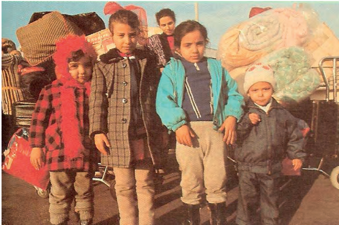
A photograph of Jewish children arriving at Ben-Gurion Airport in Israel in 1990. They have just arrived from the Soviet Union.

21 Look at the photograph, and then answer the questions which follow.