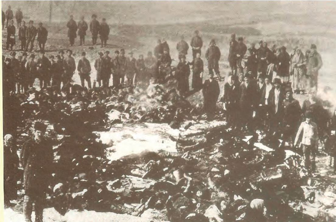
A photograph of striking workers killed by the police at the Lena gold field, 1912.