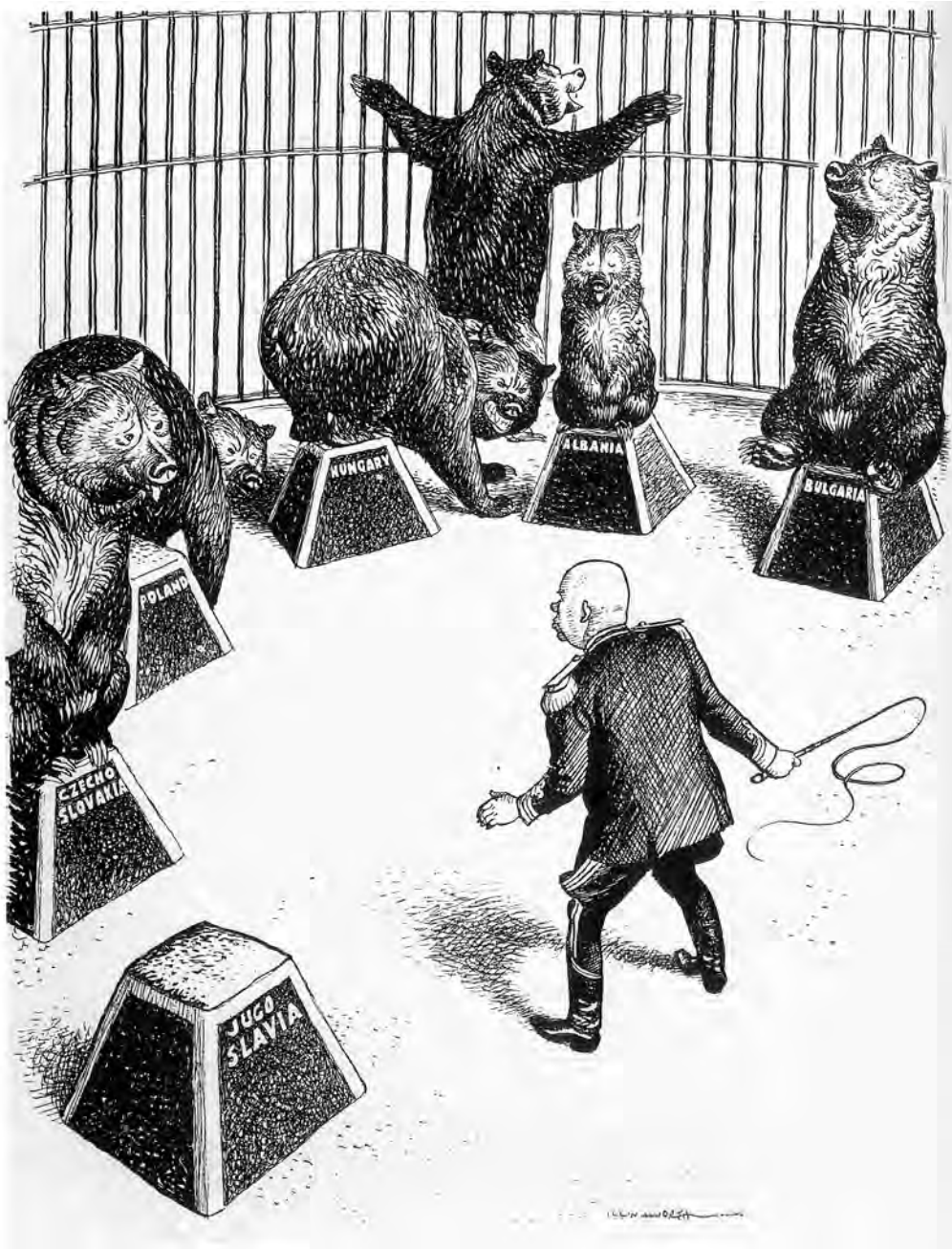
A cartoon from a British magazine, October 1956. The ringmaster is Khrushchev.