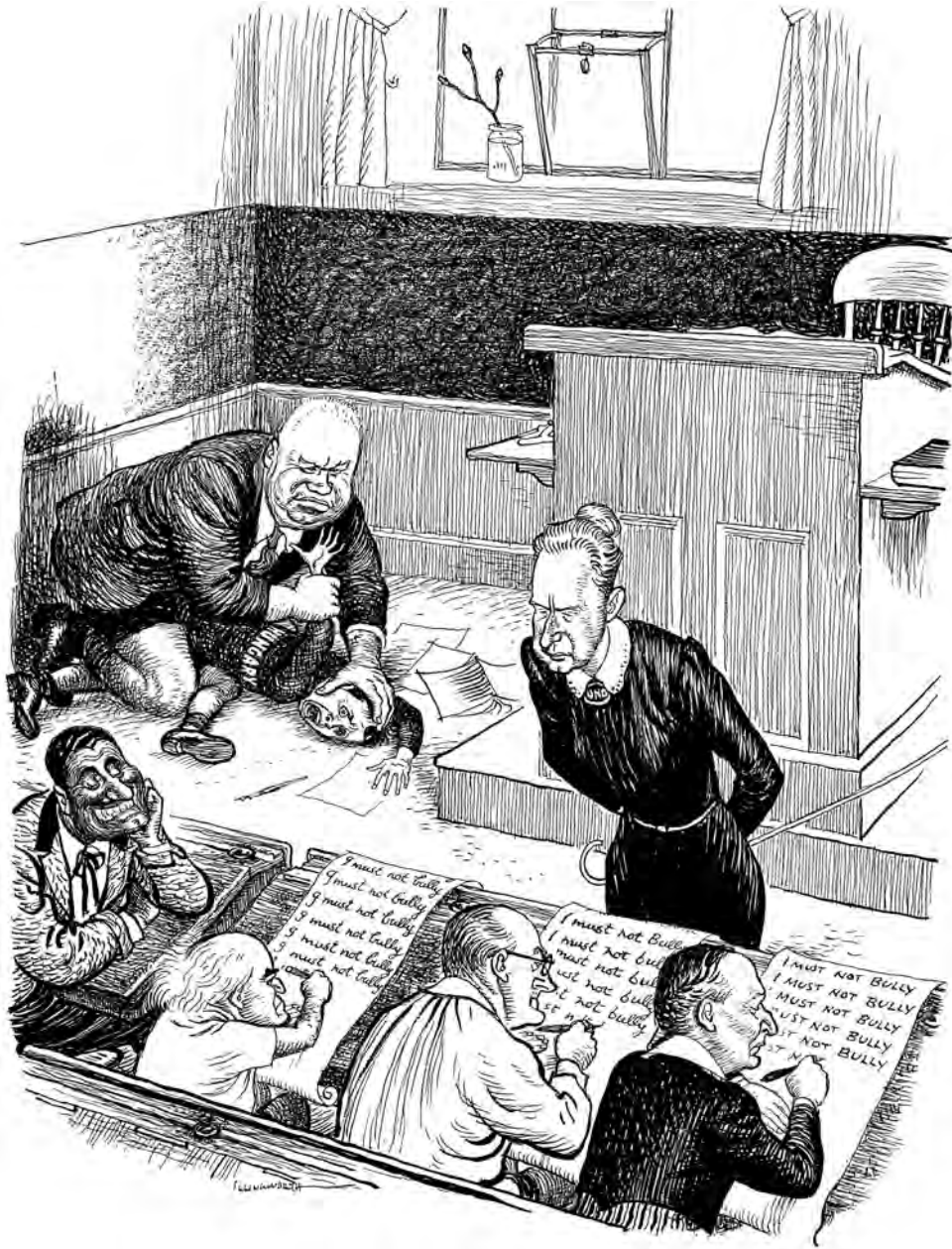
A cartoon from a British magazine published in November 1956, during the Suez Crisis. The figures at the bottom of the cartoon represent President Nasser of Egypt and the governments of Israel, Britain and France.