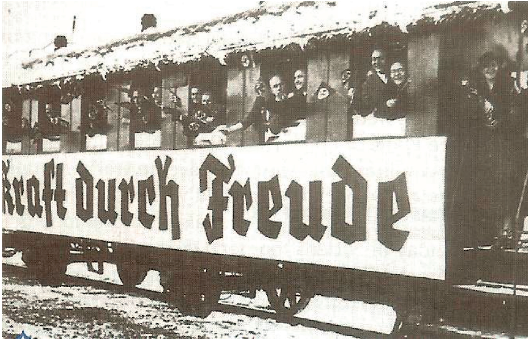
A photograph of German workers on a trip organised by the 'Strength Through Joy' movement.

10 Look at the photograph, and then answer the questions which follow.