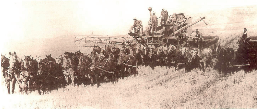
A photograph of recently introduced harvesting machinery on a farm in 1923.