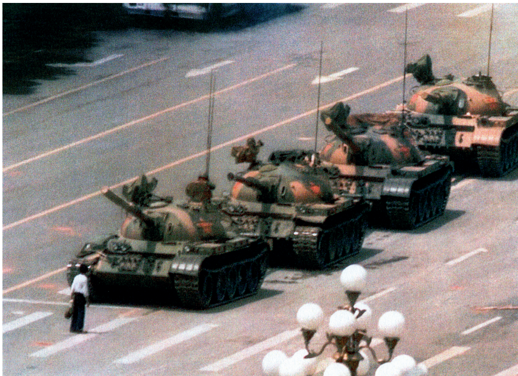
A photograph of tanks in Tiananmen Square, Beijing, June 1989.

16 Look at the photograph, and then answer the questions which follow.