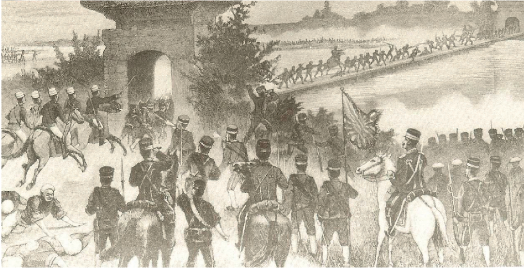
A painting of Japanese troops capturing Pyongyang in Korea during the war with China in 1894–5.