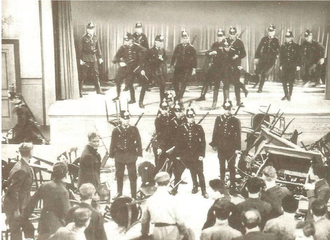
A photograph of the police dealing with the aftermath of a fight between the SA and the Communists, 1932.