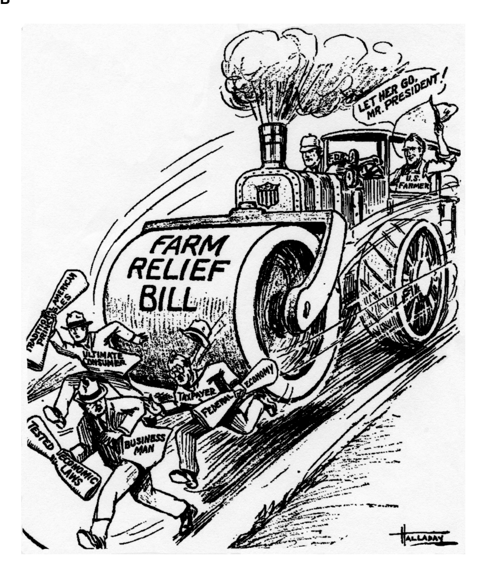
From a 1933 American newspaper.