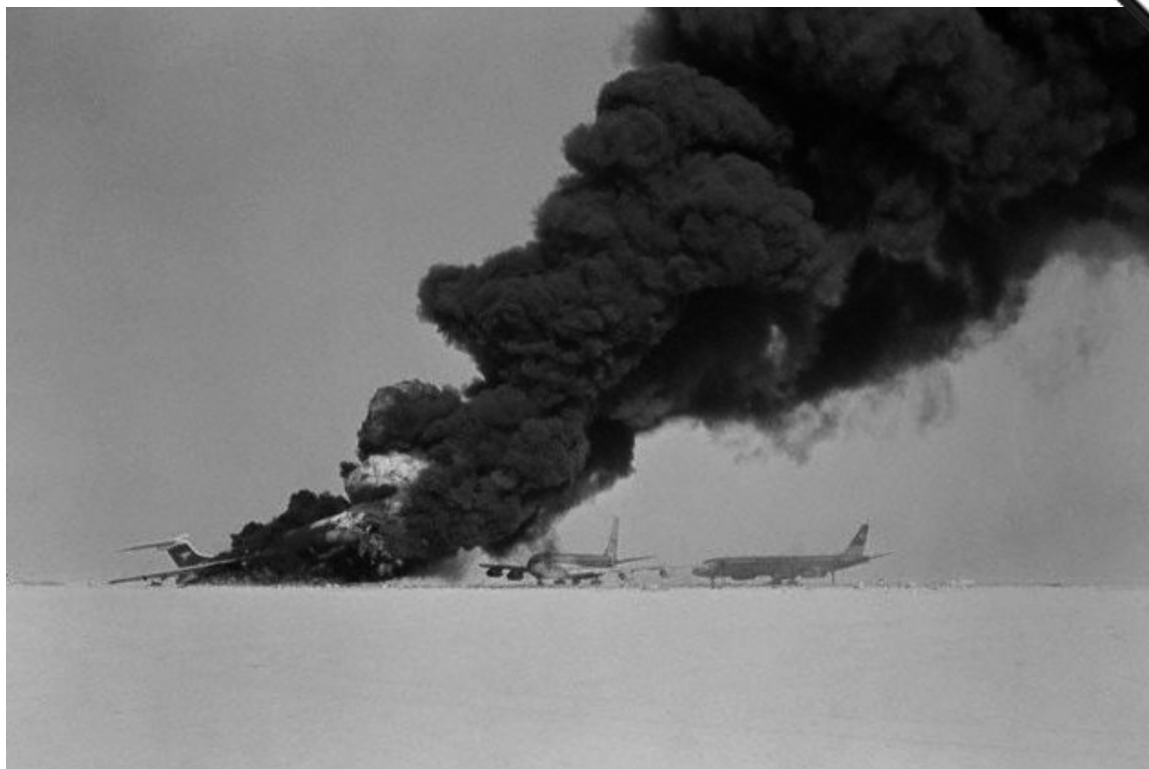
A photograph of a hijacked airliner, Jordan 1970.

21 Look at the photograph, and then answer the questions which follow.