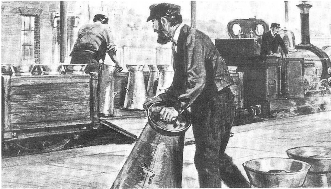
Milk churns being taken by train from farms in the west of England to the City of London.

22 Look at the illustration, and then answer the questions which follow.