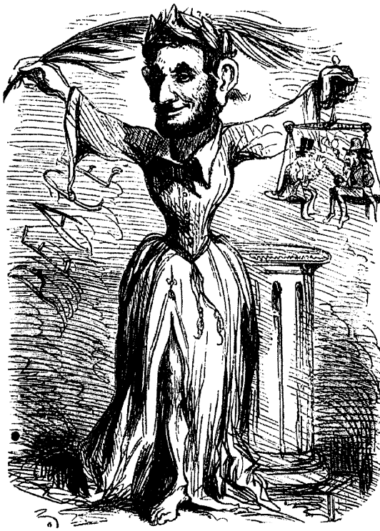
This is the way the North received it