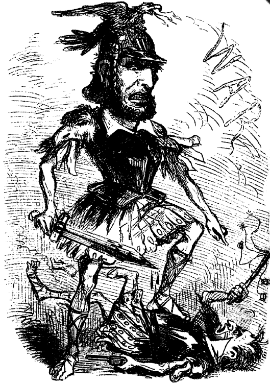
This is the way the South received it