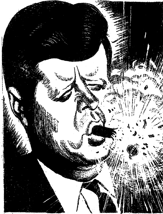
A cartoon published in Britain on 21 April 1961. The cigar represents the Bay of Pigs invasion.