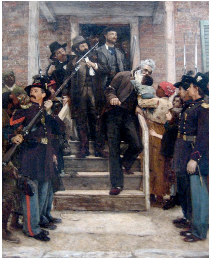
'The Last Moments of John Brown' painted in 1859.