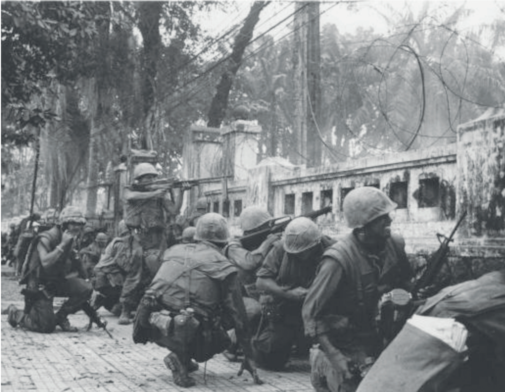
A photograph of US marines pinned down by Vietcong snipers in the city of Hue during the Tet Offensive, 1968.