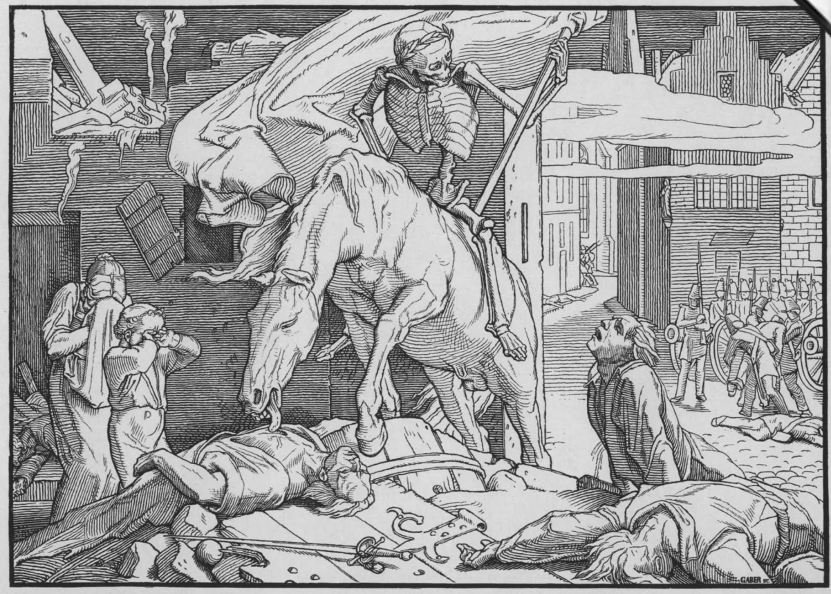
A drawing, from the time, of the disturbances in Berlin. It is entitled 'The Dance of Death, 1848'.