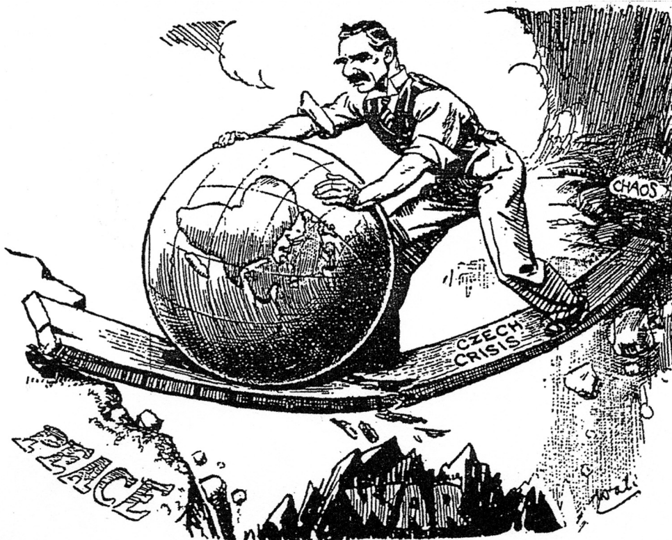
A cartoon published in a British newspaper on 25 September 1938. The man in the cartoon is Chamberlain.