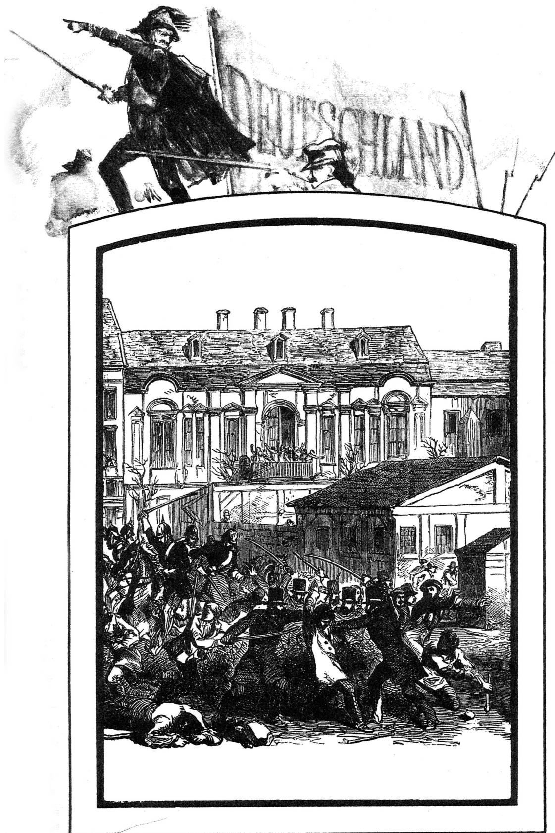
A drawing of the disturbances in Berlin, published in Britain in May 1849.