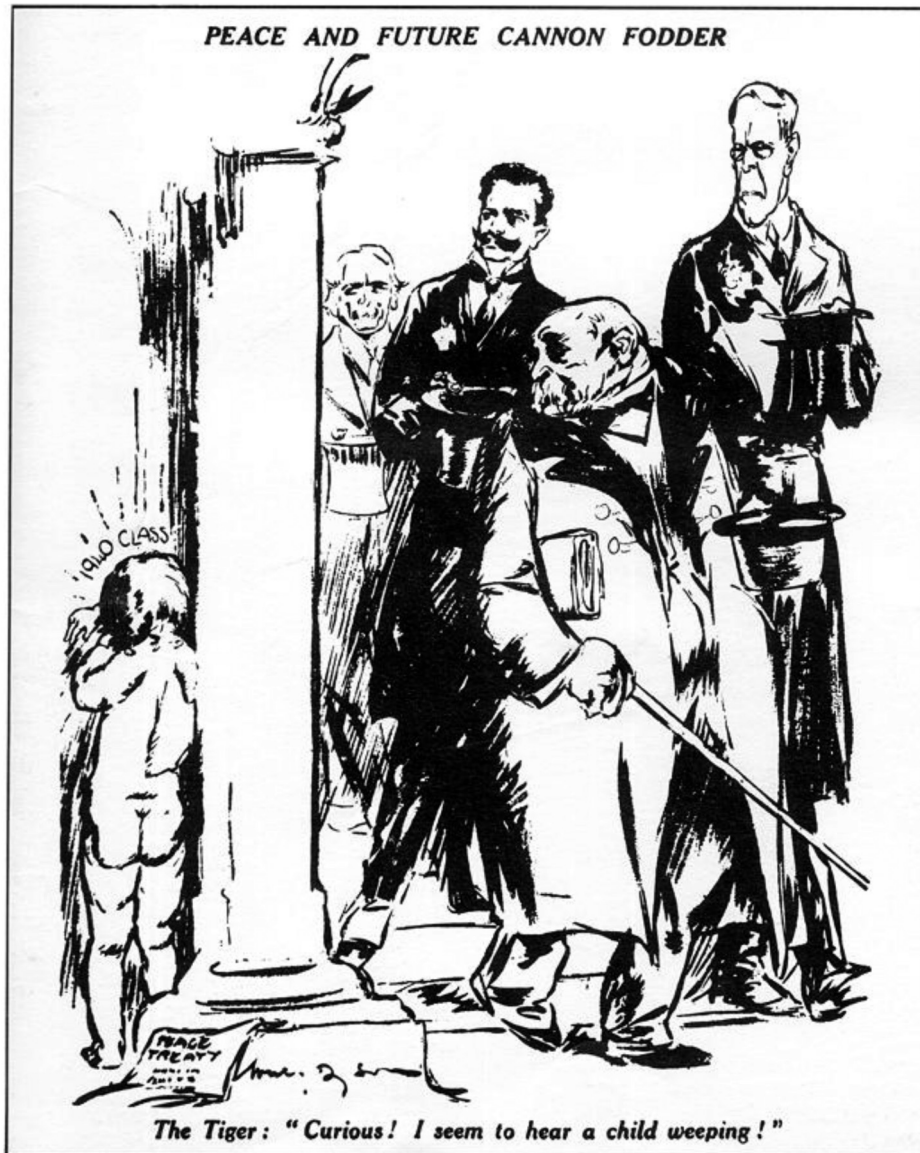
A cartoon published in a British newspaper, May 1919. 'The Tiger' refers to Clemenceau.