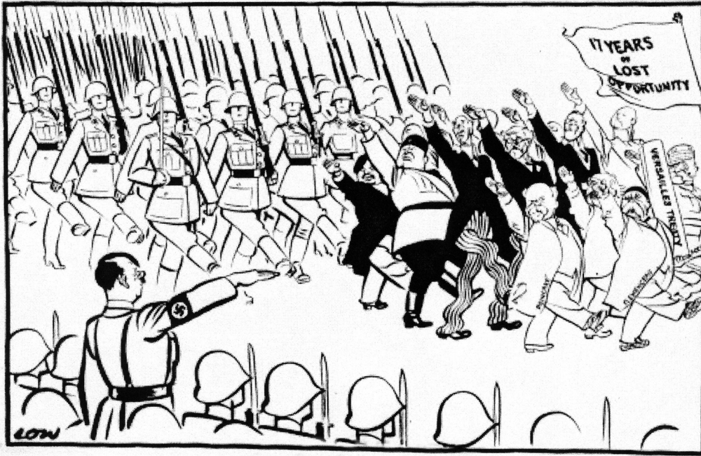
A cartoon, entitled 'Cause Precedes Effect', published in a British newspaper, 1935. It shows a parade of world statesmen led by the Versailles peacemakers.