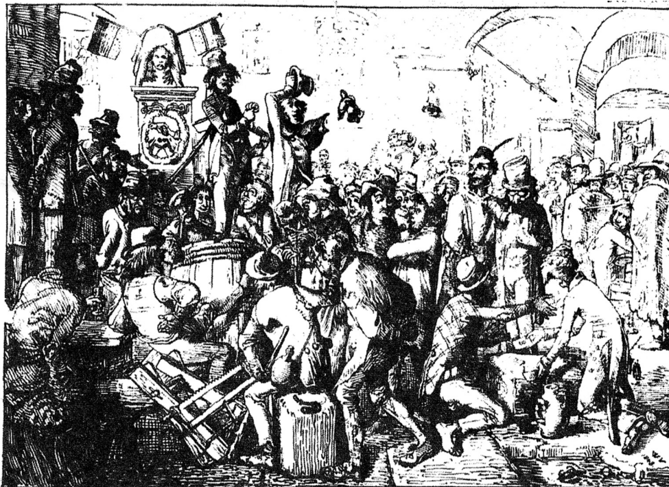
A cartoon published in Germany in 1848 entitled 'Parliament of the future'.