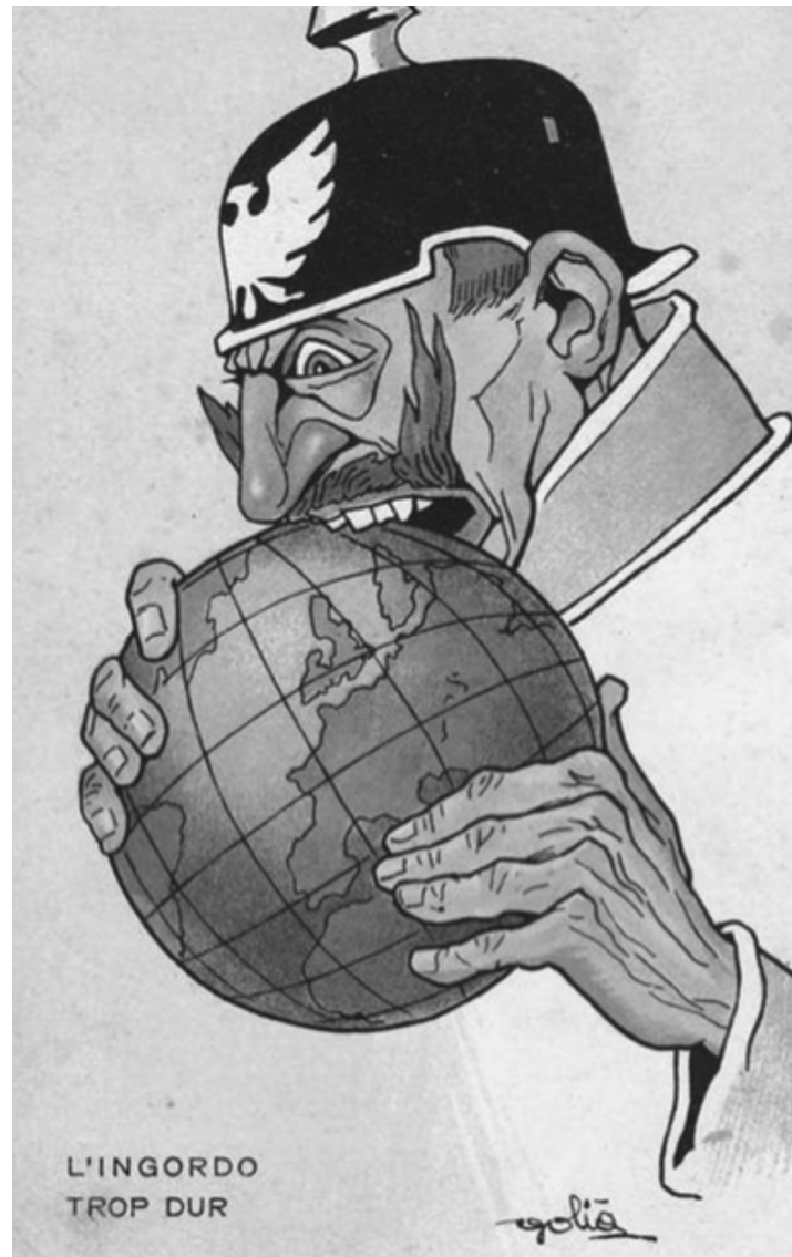
A French postcard published at the beginning of the war. The caption reads 'The glutton – too hard'. A glutton is someone who eats too much.