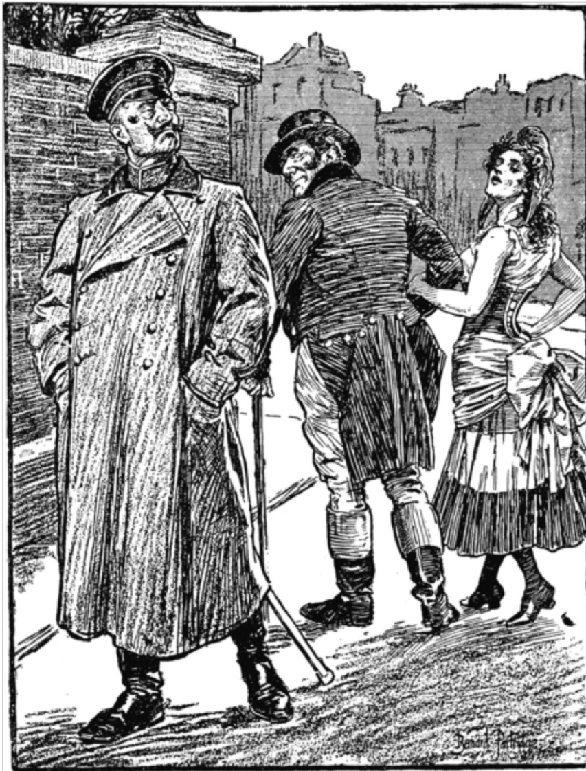
A cartoon published in Britain in 1904. Britain is shown with France.