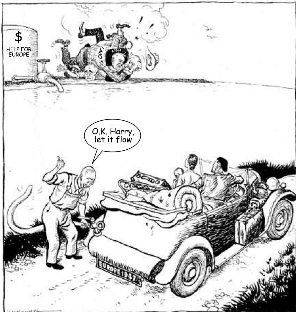
A cartoon published in Britain, June 1947. Marshall is speaking to Truman, who is held down by his opponents.