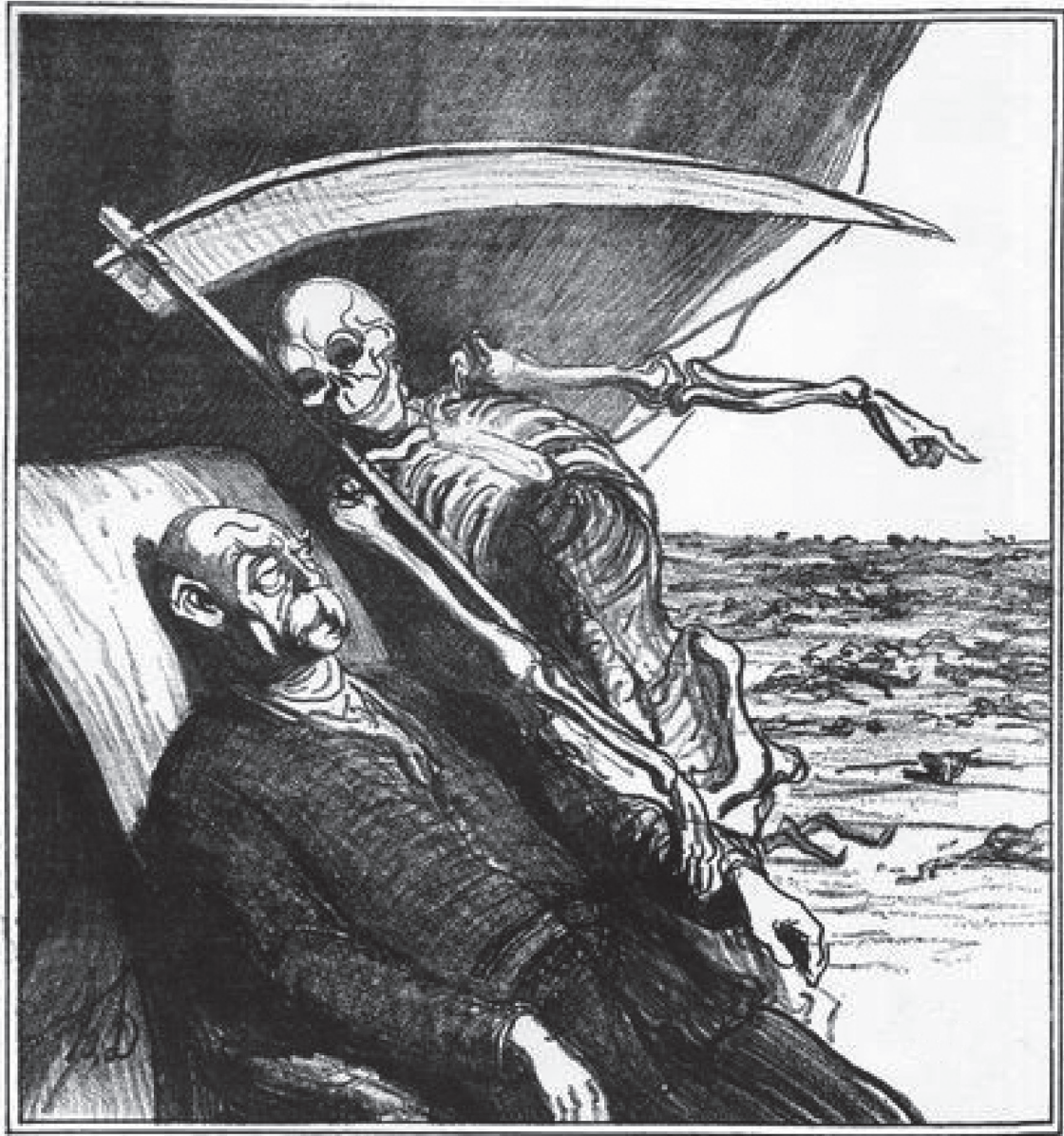
A cartoon published in France in August 1870 showing the war dead. The title of the cartoon is 'News'. The caption under the cartoon said, 'Bismarck's nightmare.' The Grim Reaper is saying, 'Thank you!...'