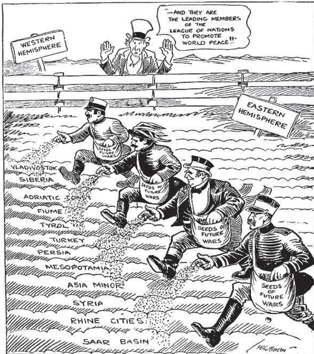
An American cartoon, 1920.