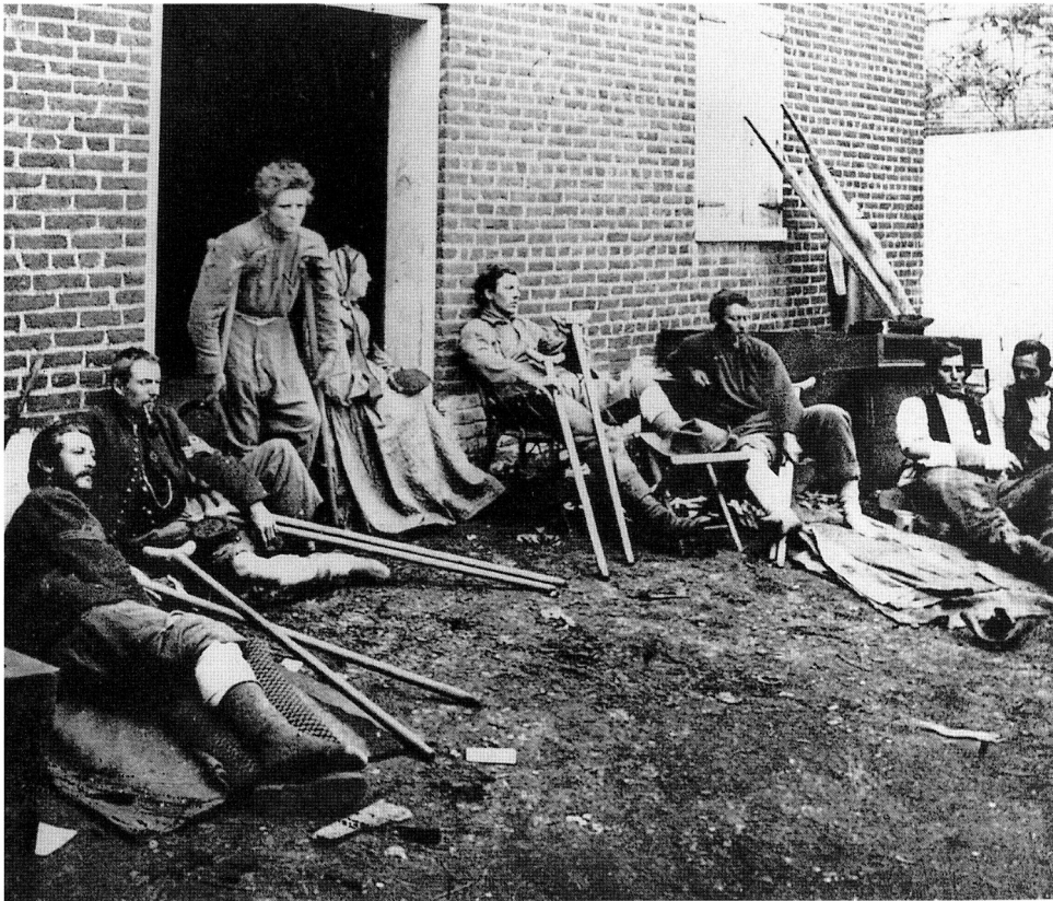
A photograph of Union soldiers wounded at the Battle of Fredericksburg, December 1862. The photograph was actually taken in May 1863.