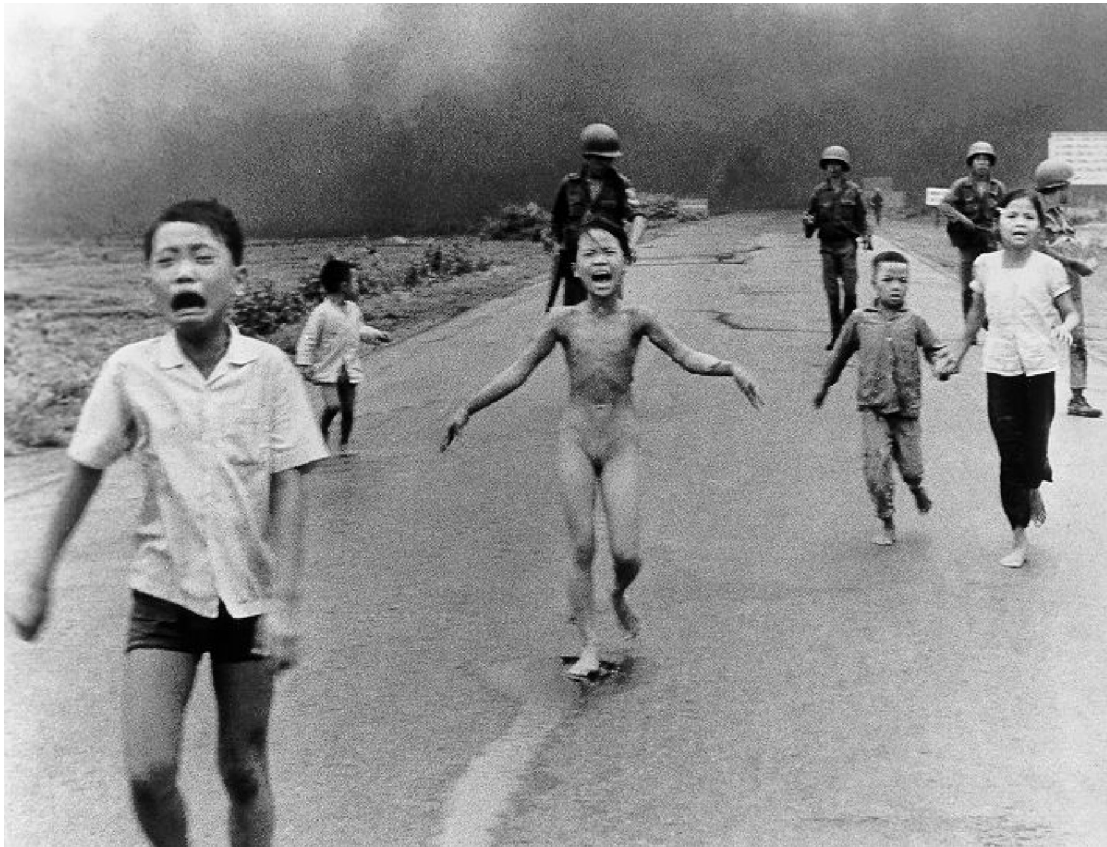
A photograph by Nick Ut, an Associated Press photographer, June 8, 1972. It shows children, followed by South Vietnamese troops, on a road near Trang Bang following an aerial napalm attack on suspected Viet Cong hiding places.