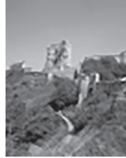
The image after the change