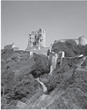
The image before the change