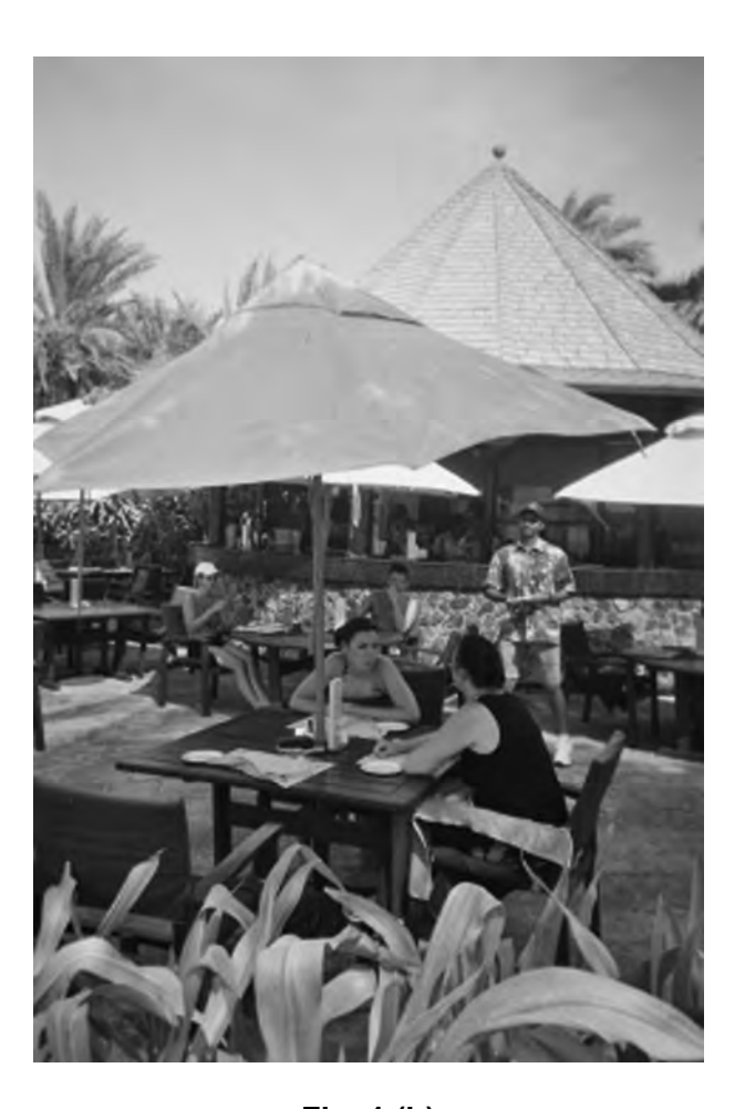
Fig. 1 (b)

(b) Many 5* resort hotels provide beachfront food and drink facilities such as the shown in Fig. 1(b).