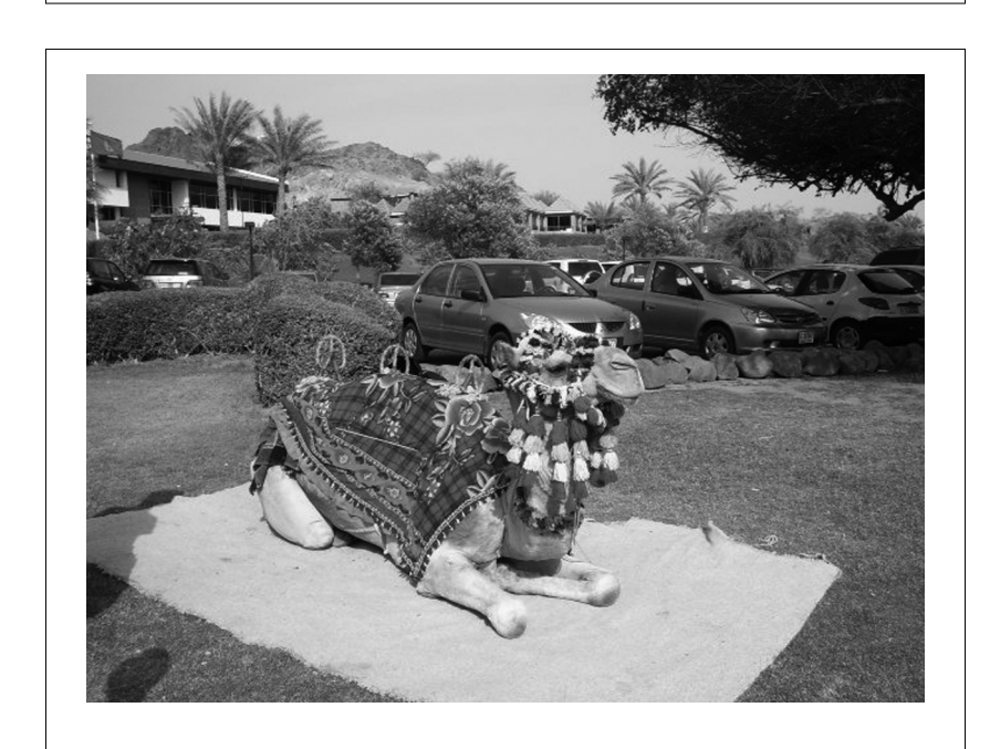
Photograph B (camel rides)