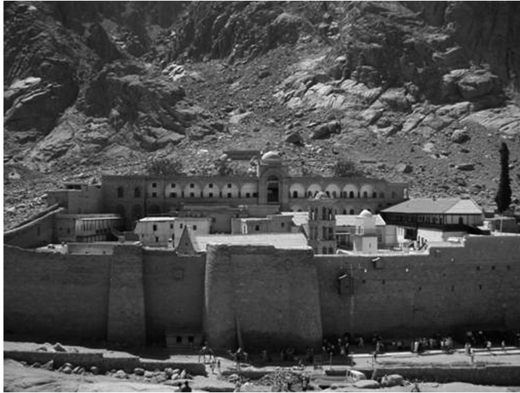
Fig. 4 for Question 4

St. Catherine's Monastery is an Orthodox monastery on the Sinai peninsula at the base of Mount Sinai in Egypt. One of the oldest Christian monasteries in the world, St. Catherine's includes the burning bush seen by Moses and contains many valuable religious icons. This area is sacred to three world religions: Christianity, Islam and Judaism.