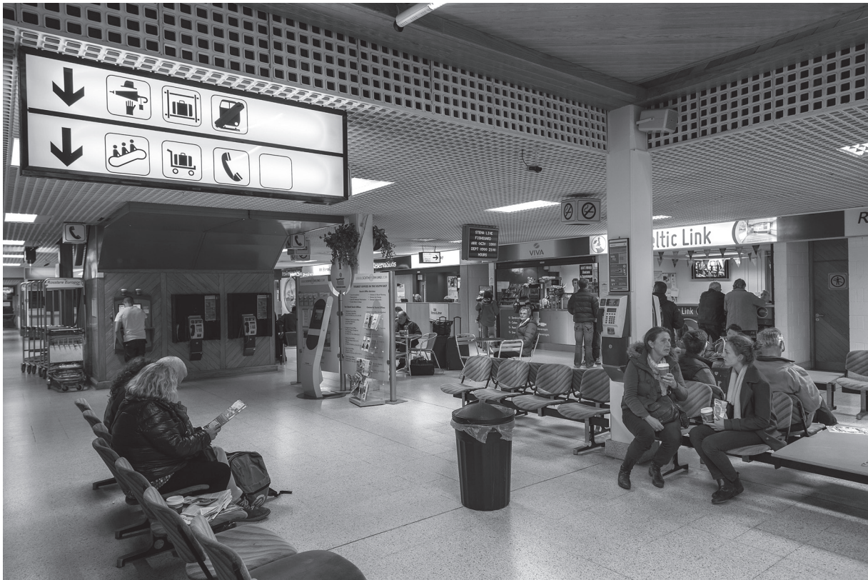
Waiting area at a ferry terminal, Rosslare, Ireland.