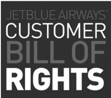
Fig. 3 for Question 3

JetBlue is dedicated to making every part of your experience as simple and pleasant as possible. Unfortunately, there are times when things do not go as planned. If you are inconvenienced as a result, we think it is important that you know exactly what you can expect from us. That's why we created our Customer Bill of Rights. These Rights will always be subject to the highest level of safety and security for our customers and crew members.