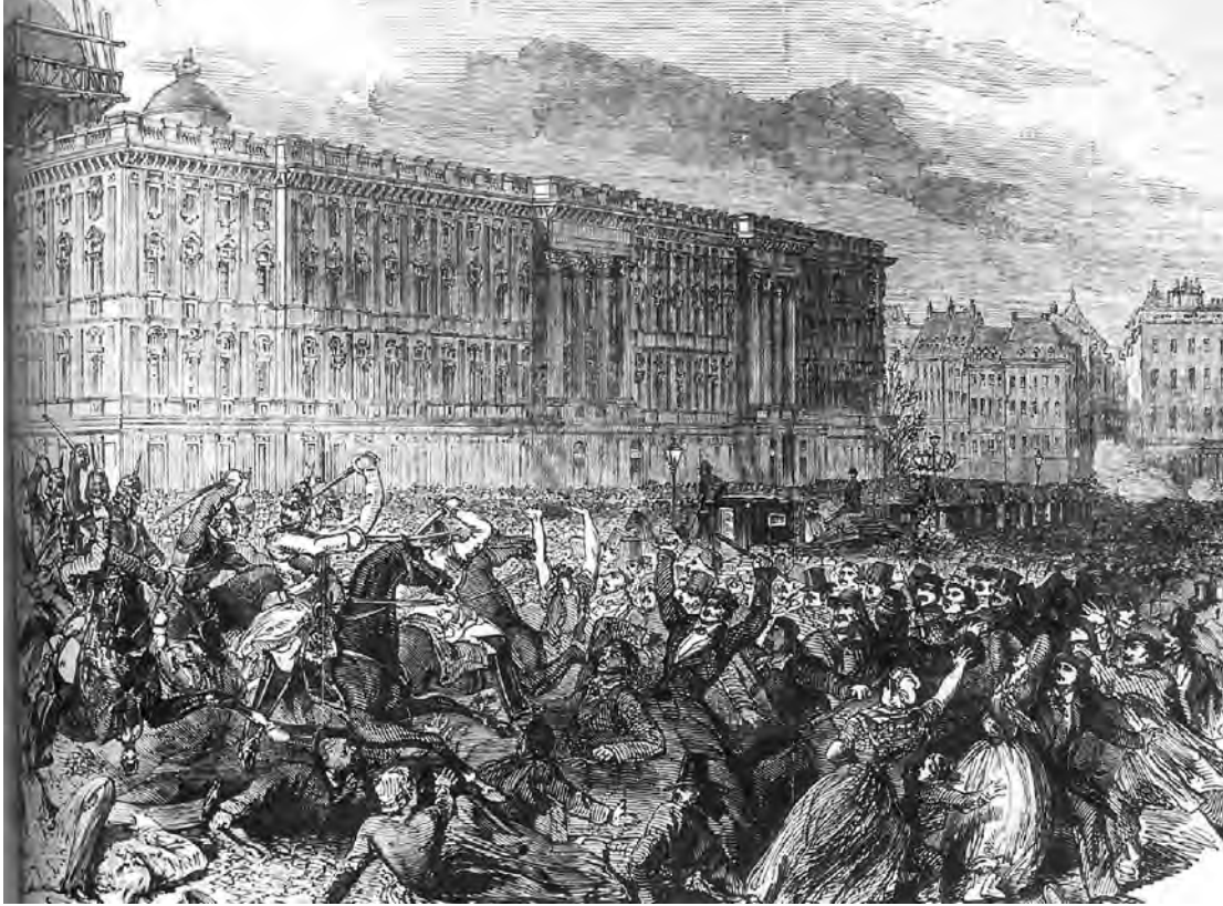
A contemporary engraving of events in Berlin, 1848.