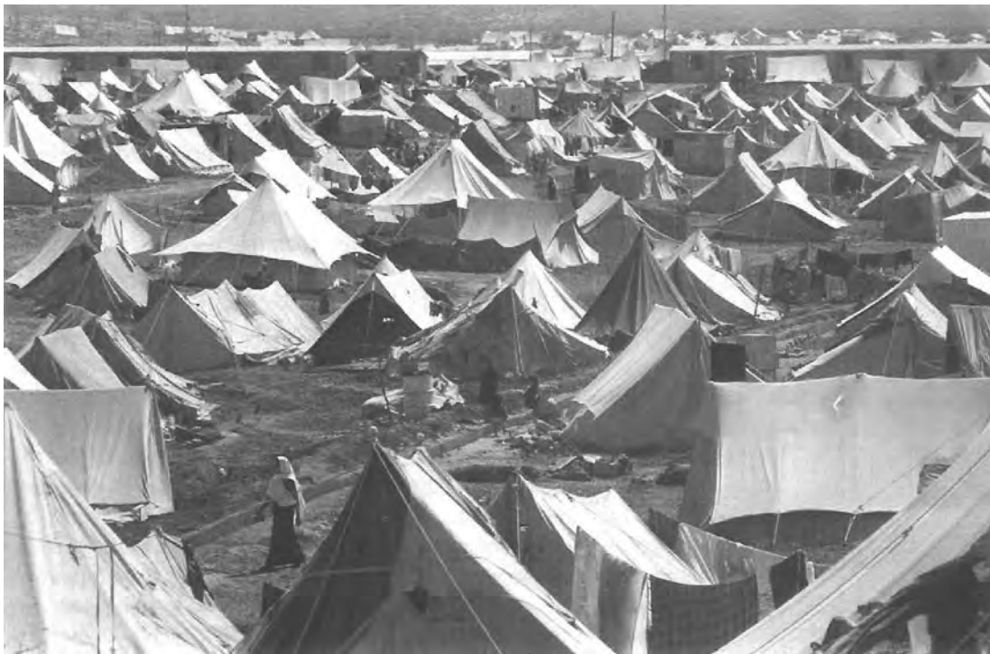
A photograph of a Palestinian refugee camp in Jordan in 1949.

21 Look at the photograph, and then answer the questions which follow.