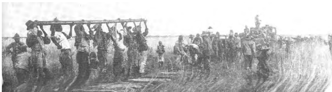
A photograph showing the construction of the Otavi Railway across Herero land in 1903.