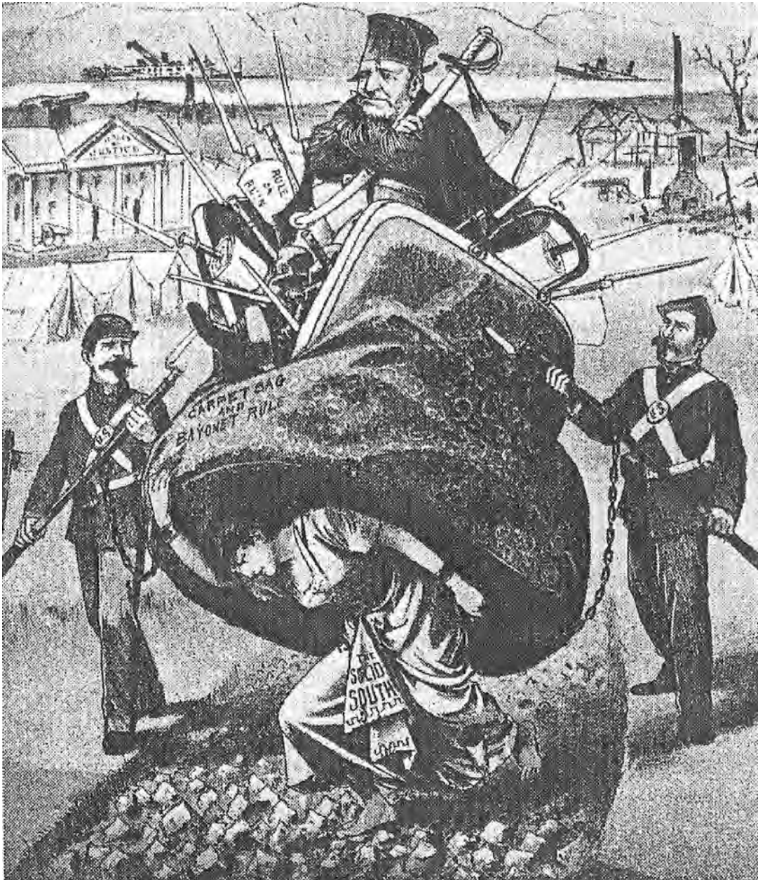
A cartoon published in 1880 showing 'carpetbagging' oppressing the South.