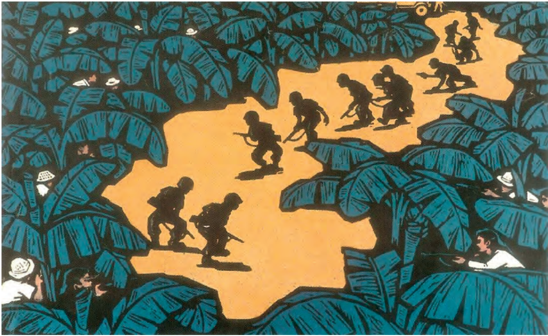
A Vietcong poster.