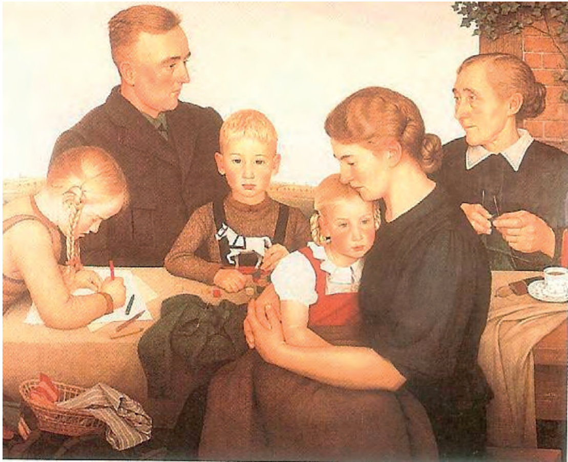
A painting showing a German family, 1939.

10 Look at the painting, and then answer the questions which follow.