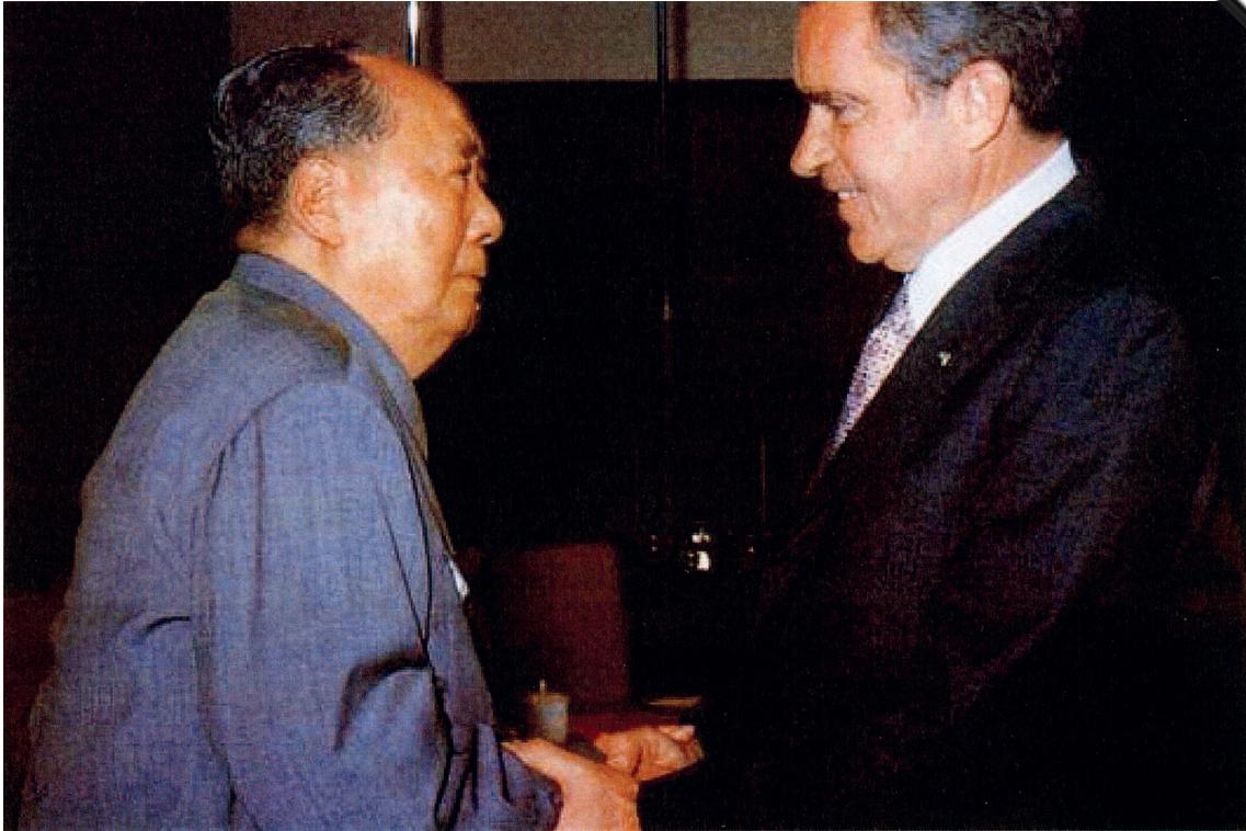
A photograph of Mao meeting with US President Nixon in 1972.

16 Look at the photograph, and then answer the questions which follow.