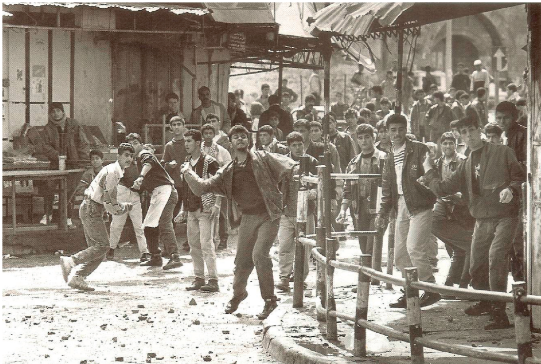
A photograph of young Palestinians throwing stones at Israeli soldiers in Gaza in 1987.

21 Look at the photograph, and then answer the questions which follow.