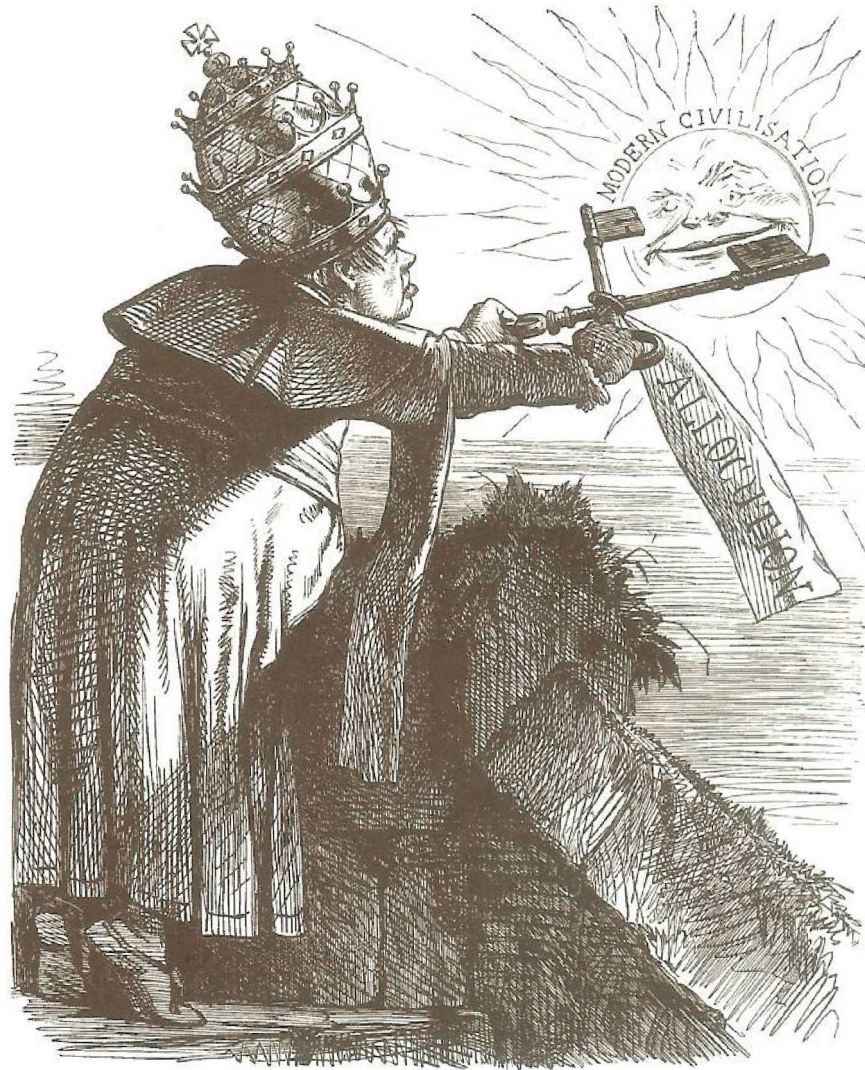
Papal Allocution.—Snuffing out Modern Civilisation.

2 Look at the cartoon, and then answer the questions which follow.