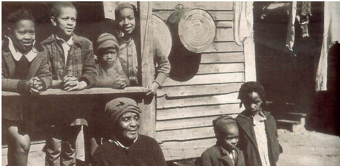
A photograph of a black family at home in the southern state of Virginia, during the 1920s.

13 Look at the photograph, and then answer the questions which follow.