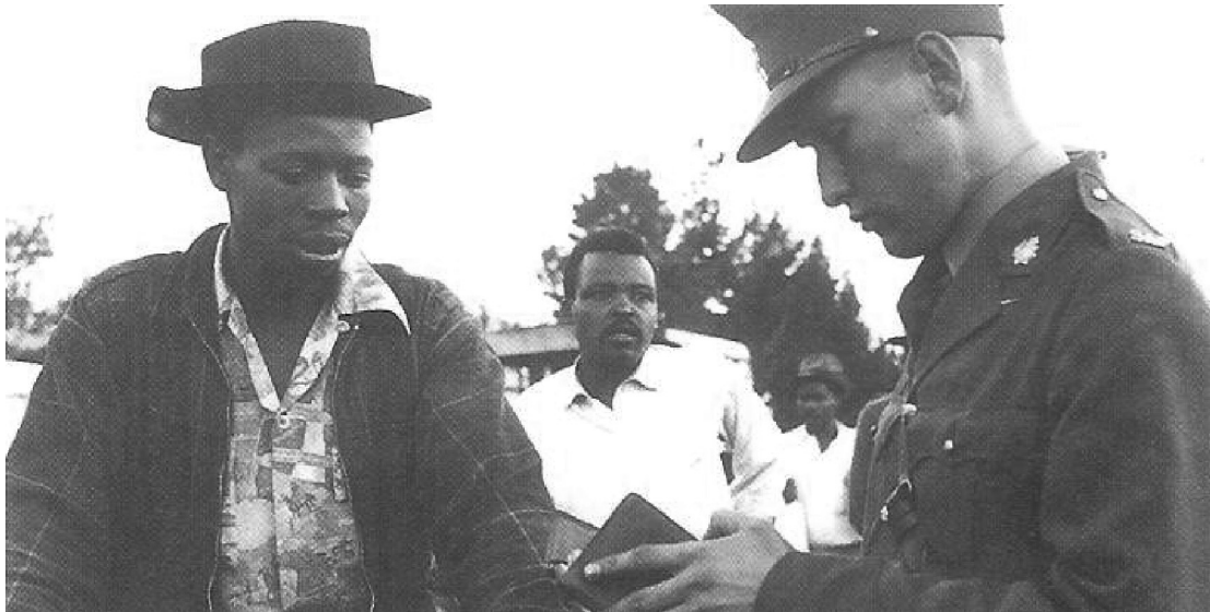
A photograph of a policeman inspecting the pass belonging to a black South African.

18 Look at the photograph, and then answer the questions which follow.