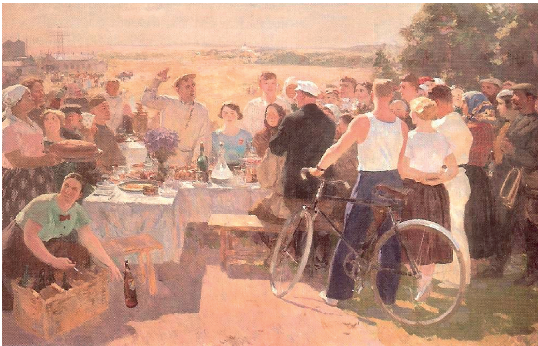
A Soviet painting from 1937, showing life on a collective farm.

12 Look at the painting, and then answer the questions which follow.