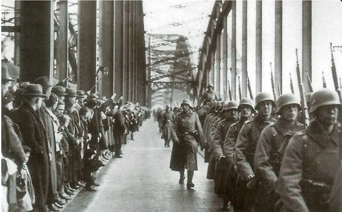
A photograph of German forces crossing the Cologne Bridge to enter the Rhineland in 1936.