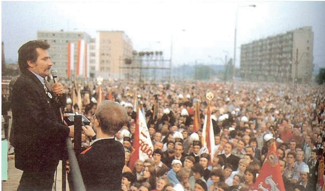
A photograph of Lech Walesa, the 'Solidarity' leader, speaking at Gdansk in 1980.

8 Look at the photograph, and then answer the questions which follow.