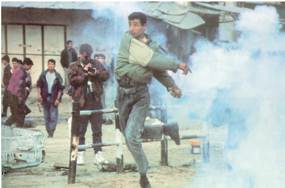
A photograph of a Palestinian protester in Hebron.

21 Look at the photograph, and then answer the questions which follow.