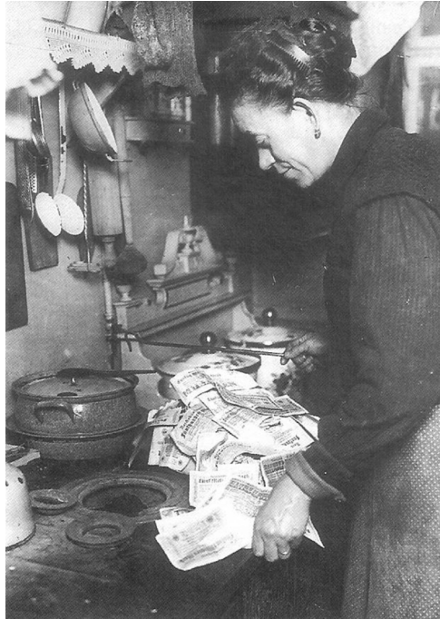
A photograph taken in 1923 showing a German housewife using paper money to light her kitchen stove.