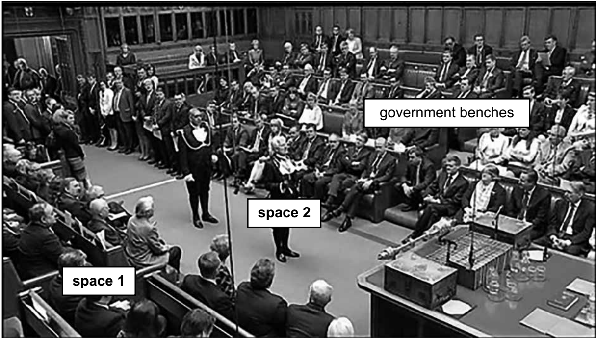
Fig. 13 The commons' chamber at the state opening of parliament

13 Study Fig. 13 and answer Questions 13(a) , 13(b) and 13(c) .